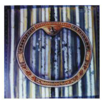
Plate 21: Artist: Kunle Filani Title: Fortune is Mine Medium: Acrylic Year: 2003