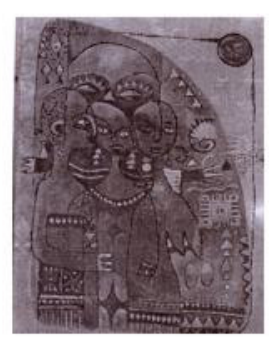
Plate 15: Artist: Tola Wewe Title: Female Icons Medium: Oil on Canvas Year: 1998