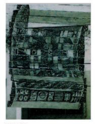
Plate 2: Artist: El Anatsui Title: Invitation Into History Medium: Wood and Tempera Year: 1995