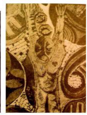
Plate 11: Artist: Aniakor Chike Title: Ikenga Medium: Pen/Ink on Paper Year: 1962