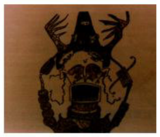
Plate 7: Artist: Uche Okeke Title: Maiden's Cry Medium: Pen/Ink on Ppaper Year: 1962