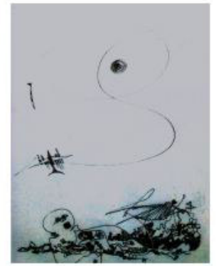
Plate 3: Artist: Obiora Udechukwu Title: Air Raid Medium: Pen/Ink on Paper Year: 1989