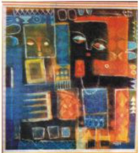
Plate 17: Artist: Tola Wewe Title: Comb of Divorce Medium: Guache on Canvas Year: 2000