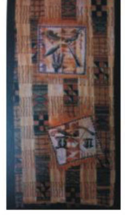
Plate 22: Artist: Kunle Filani Title: Relics of Grandma Medium: Acrylic on Canvas Year: 2003