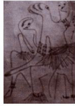
Plate 10: Artist: Uche Okeke Title: Oyolima Dancers Medium: Pen/Ink on Paper Year: 1963