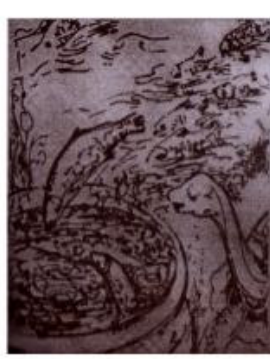
Plate 9: Artist: Uche Okeke Title: Ite Ofe Mbe Medium: Pen/Ink on Paper Year: 1966