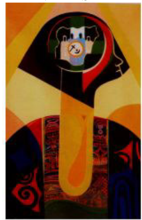
Plate 1: Artist: Tayo Adenaike Title: Burden of the Leaders Medium: Acrylic on Canvas Year: 1995