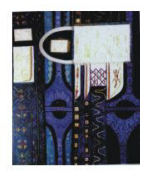
Plate 23: Artist: Kunle Filani Title: Patterns of Honour Medium: Mixed Media Year: 2003