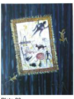
Plate 20: Artist: Kunle Filani Title: Vestiges of the Past Medium: Oil and Guache on Canvas. Year: 2000