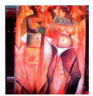
Plate 16: Artist: Tola Wewe Title: Sensual Vibes Medium: Guache on Canvas Year: 1998