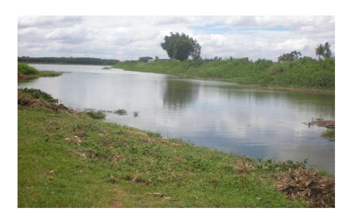
Fig.4. Storm water.

2.3. Collection and Preparation of Water Samples