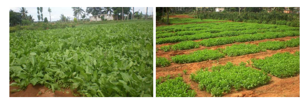
Fig.2. Palak leaf vegetation.