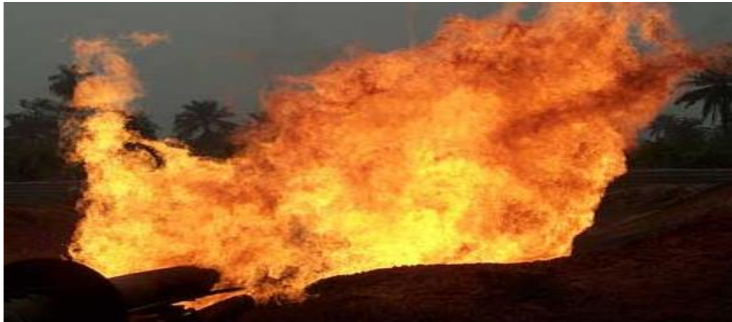
Figure 5: The Shell gas flare at Rumuekpe, River State in the Niger Delta.

organic compounds like benzene, toluene, xylene and hydrogen sulfide, as well as carcinogens like benzopyrene and dioxin cause variety of respiratory problems (Friends of the Earth, 2005). These chemicals can aggravate asthma, chronic bronchitis as well as leukemia and other blood-related diseases. A study done by Climate Justice estimated that exposure to benzene would result in eight new cases of cancer yearly in Bayelsa State alone (Friends of the Earth, 2005).