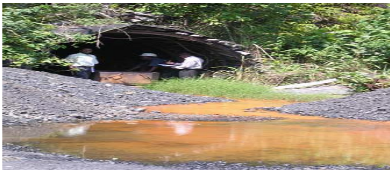
Figure 6: Contaminated Water issuing from Okpara coal mine, Enugu

Other than human health hazards, coal exploitation has great impact on the soil. Soil removals from the area to be surface mined alters or destroy many natural soil characteristics, and may reduce its productivity for agriculture or biodiversity. Dust degrades air quality in the immediate area. Waste piles and coal storage piles can yield sediment to streams, and leached water from these piles can be acid and contain toxic trace elements. Surface waters may be rendered unfit for agriculture, human consumption, bathing, or other family (Bascom et al. 1996).