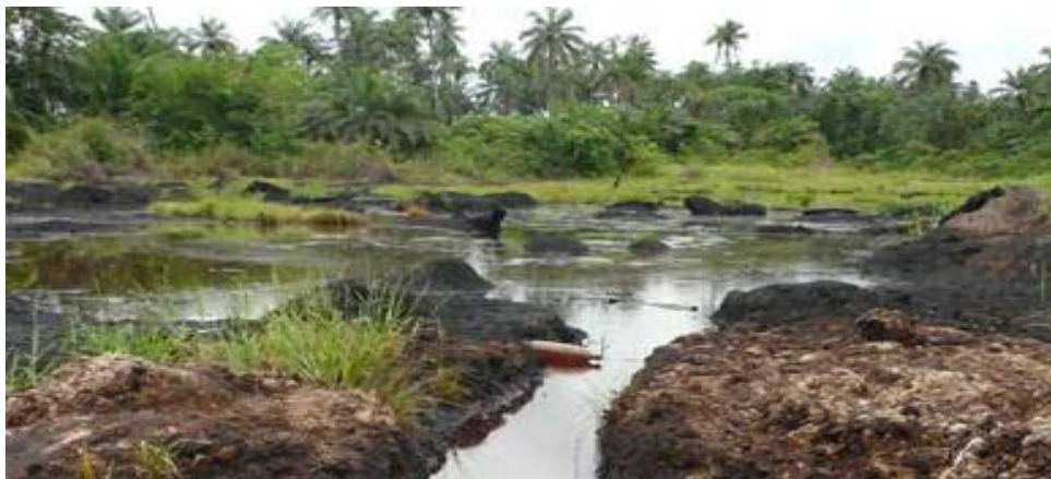
Figure 3: The impact of an oil spill near Ikarama in the Niger delta.

Crude oil or refined petroleum product spillage may cause damage to the environment in many ways. In water, oil film floating on the water surface could prevent natural aeration and lead to the death of marine life. Fish that ingest spilled oil or other food materials impregnated with oil have been observed to be unpalatable (Nwankwo & Ifeadi, 1988). Oil spillage on land may lead to retardation of vegetation growth and cause soil infertility for a long period of time until natural processes re-establish stability.