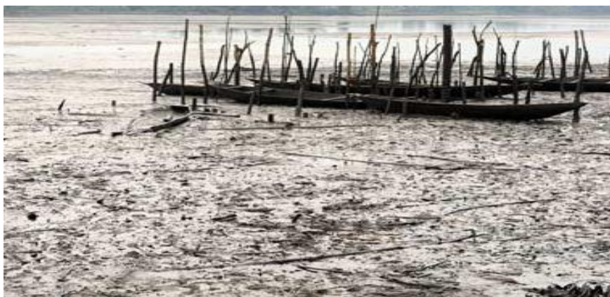
Figure 4: Several years of fishing boats lie abandoned in oil-polluted water near Bodo, Niger Delta, Nigeria.