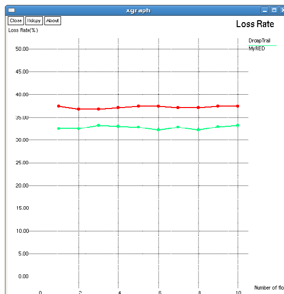
Figure 5.3 Loss rate comparison of proposed approach

Lastly the loss rate observed in simulation setup is also far better (lesser) in our approach in comparison to that of Drop tail approach.