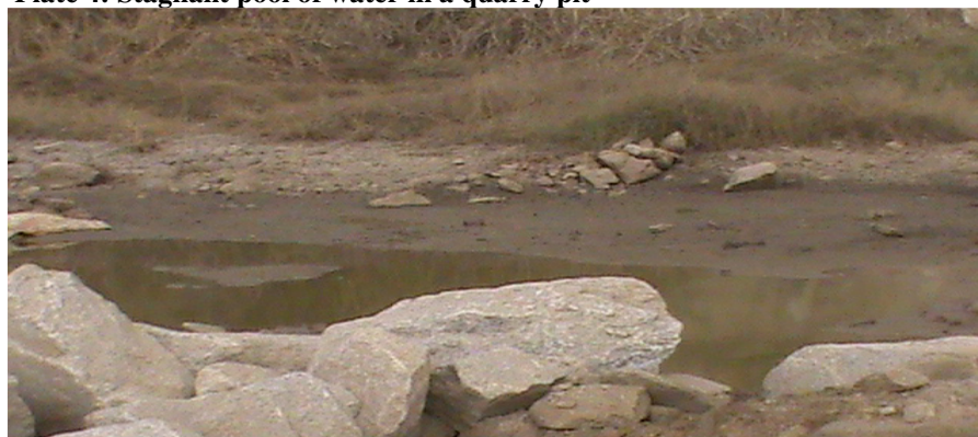
Plate 4: Stagnant pool of water in a quarry pit

The respondents also complained of loud, deafening, incessant noise from blasting and breaking of rock boulders that can have serious health implications. Such noise from especially the large-scale quarrying concerns (for example KAS Quarry Company limited) is problematic. Pockets of small and large gaping holes associated with quarrying activities not only destroy the aesthetic beauty of the landscape but also become suitable breeding grounds for mosquitoes when rainwater collects in them (Plate 4).