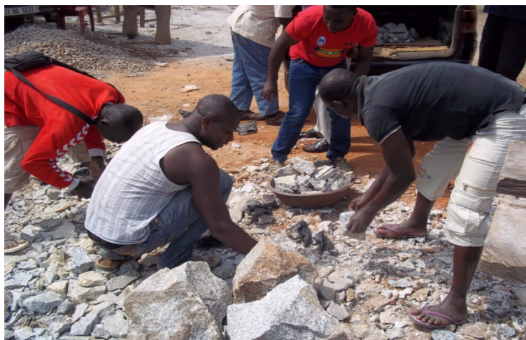
Plate 1: The nature of the small-scale quarry industry in Nkukua Buoho.

In the household survey, 68 per cent of the respondents were directly engaged in the quarrying industry. Of this number, only 5 per cent worked with the big quarry companies (Table 1). The indication is that majority of the respondents operate on a small-scale basis as indicated in Plate 1.