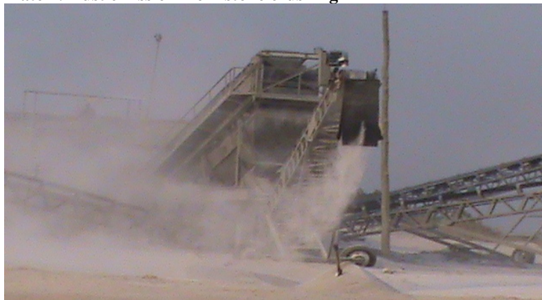
Plate 2: Dust emission from stone crushing