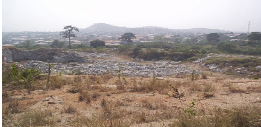
Plate 3: Degraded state of the environment caused by quarrying in Nkukua Buoho