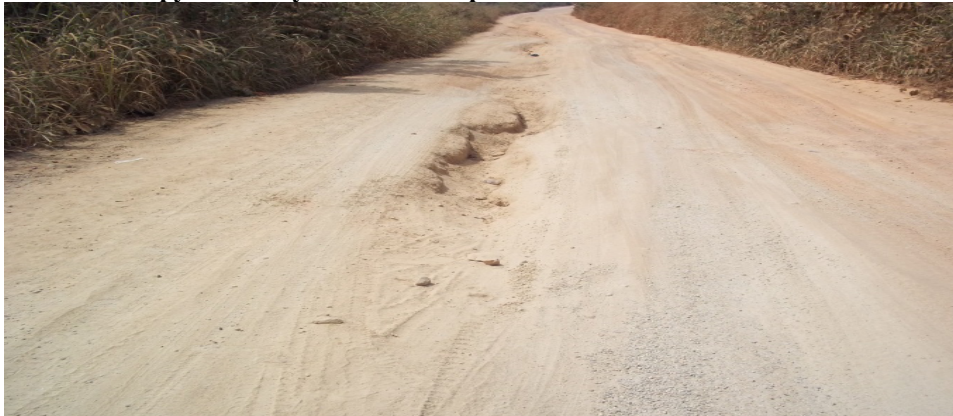
Plate 5: Bumpy and dusty road with deep surface holes