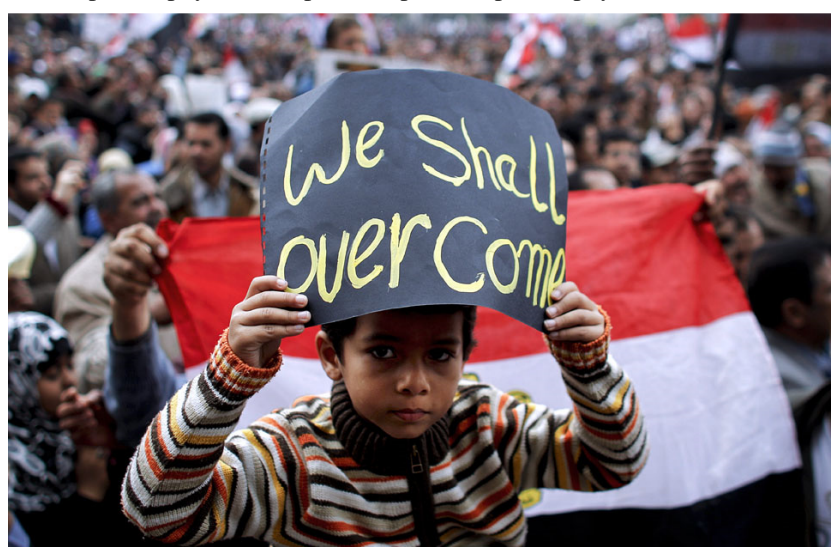
1.7 Change: A Creative Philosophical Concept for the Rebirth of the New Arab World

In the postmodern world, philosophy had asserted itself away from science, surpassing the belief prevailed in the past that philosophy survival is linked to its alignment with science, as the number of those who believe that the physical component of life does not solve a lot of its issues, therefore philosophy is required and has a necessary role in addressing people directly. This new role of philosophy made it "popular", and imposed it to support political movements such as communism and Nazism, even supporting political and economical systems such as capitalism, and with the spread of liberal traditions that prevailed as the new world being shaped had helped the prosperity of practical philosophy at the expense of political philosophy.