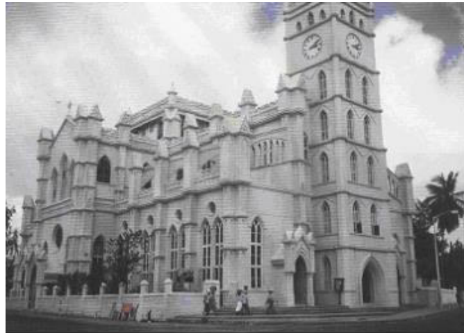
Plate 4.2.1. Exterior view of the church when it dominated its environment

later expanded to accommodate more. The construction was in three phases and lasted for 21 years with the first phase commencing on 21 April 1925 and the final phase being completed on 1 st May 1946.