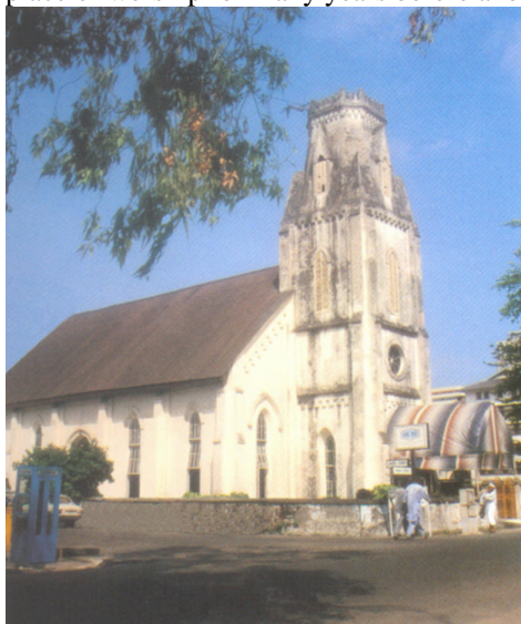
Plate 4.1.1. Exterior view showing the Gothic window and the tower

Before the completion of this building self-determination began to arise among the leadership of the Church which led to reverting from their adopted English names to the traditional names because Christianity was being closely linked to cultural imperialism of the Western world. After the dedication of the church building, there arose another dispute which led to a breakaway. The breakaway group pulled out of the church without referring the matter to the home Mission in America and held its first service under a temporary shed in a yard along Wesley Street, Lagos. Before the end of that week, a bamboo shed was put up in that yard and it became their place of worship for many years before another site was acquired for the construction of their own building.