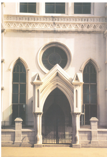
Plate 4.2.2 Entrance Porch

Although the design exhibited, to some extent, an eclecticism of many architectural traditions in Lagos at that time, the design reflected mainly the Gothic style which was the epochal vocabulary of ecclesiastical architecture in the Roman Empire during the Middle Ages (1100 – 1690AD). The architectural characteristics of this cathedral were not different from the old Gothic period which included the emphasis on strong vertical lines, high vaulted ceilings, minimal wall space, pointed window and door openings and buttressed walls. Airy and bright focus on verticality, pointed arches, rib vaults, buttresses, large stained glass windows, ornaments and pinnacles gave a fulfilling symbol to the religious aspiration of the building. This Cathedral Church of Christ pioneered a careful attention to symbolic ecclesiastical architecture in Nigeria during the British rule.