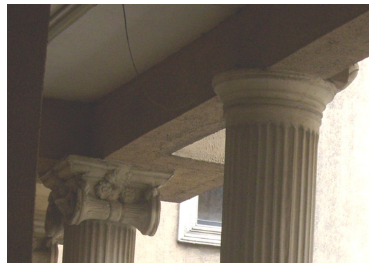
Plate 4.2.6. Columns and Cross Plate 4.2.7. & 8. Interior Views with ionic columns supporting beam details of the Cathedral Church of Christ, No. 29 Marina, Lagos (1925-1946).