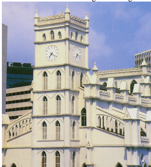
Plate 4.2.3. Exterior showing windows, columns and cross

The entrance porch celebrated the pointed arches of Gothic. The entrance tower where the bell was hung was celebrated too and clocks were hung on the four surfaces as wrist watches were uncommon. The tower symbolized a landmark as a compass for people to locate their bearings when it was difficult to do so because it was the tallest building around at the time it was constructed. The cathedral interior has three (3) aisles flanked on either side by an avenue of heavy columns which measure about nine (9) meters high each and massive volume of the interior had a domineering effect and consequently put the worshippers in awesome wonder. At the time of its completion, it dominated its environment but the subsequent development of modern high rise buildings around it created a blending continuity in sky space.