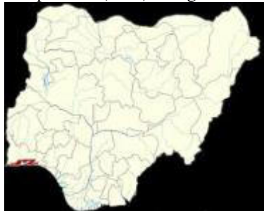
Plate 2.1 Map of Nigeria showing Lagos at left bottom side

Lagos State is identified as the custodian of the highest number of the Church buildings built during the period under study. The nature of Lagos, being one of the metropolitan mega cities, gives an impetus to the flourishing of the spread of religious activities because Christianity development has become an urban phenomenon (Anderson, 2003). Lagos' cosmopolitan structure accommodates the influence of every Nigerian tribe (Census 2006). It was also the first capital of the Federal Republic of Nigeria. Lagos State is located in the southwest part of Nigeria with a population of 9,019,534 (2006 census) and an area of 3,577 square kilometres including twenty two per cent (22%) of lagoons and creeks.