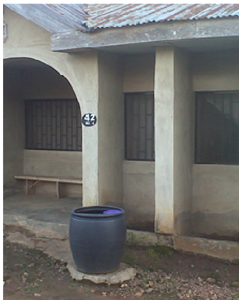
Figure 2: Traditional method of water collection in Akure South Local Government Area, Ondo State, Nigeria, from corrugated roofing sheets to plastic drums.

The main use of harvested is washing of cars, clothes, plates and cooking utensils – totaling 71.44% as seen in Table 9.