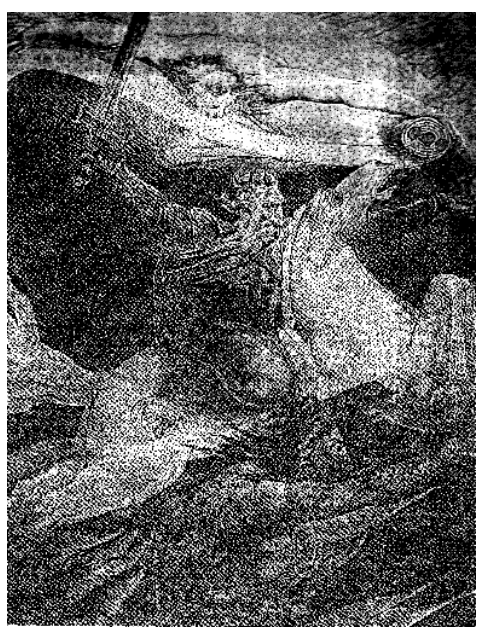
Fig. 2, William Blake, Death on a Pale Horse , circa1800, Pen and Watercolour over Pencil, 39.5 x 31.1cm, (Source: Lister 1986)

The first reference to animals in the Bible is found in Genesis 1:24 where the creation of animals on the sixth day precedes the creation of man later the same day. It is logical then that a serpent be responsible for the temptation of Eve. Durer captures the moment succinctly for us in an etching depicting Adam and Eve in the Garden of Eden covering their nakedness with leaves while Lucifer is coiled up in the branches of the tree (Genesis 3:1-20) (see Fig. 3 below).