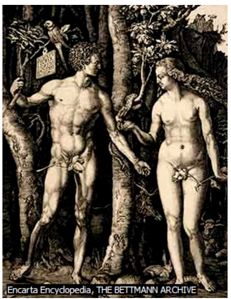
Fig. 1, Albrecht Dürer, Adam and Eve (1504), Engraving

Rembrandt's etching titled "Abraham entertaining the angels" (1656), captures the event described in Gen. 18:1-10 lucidly. Sarah is shown watching the three men from inside the tent while Abraham waits on them. He however does not know that they are angels. Of Isaiah's encounter, (Isaiah 6: 2-4) we are left in no doubt as to the fact that the "flaming creatures" are angels and that they bear wings; in this instance six each. Angels are included in this animal categorization for the simple fact that they bear wings, apparently with a semblance to those of eagles. No derogation is intended.