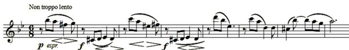
Figure 11. P. Jeanjean, Vingt Etudes Progressives et Mélodiques Pour la Clarinette, Etude No. 19, mesures from 1 to 8

In the first section, from beginning to measure 16, eighth, quarter, dotted quarter, and dotted half note values are used. It is important to perform this section according to the indicated dynamics. In the first measure, crescendo and decrescendo is used within the piano dynamic; on the contrary, in the second measure, same crescendo-decrescendo movement is utilized in forte dynamic. Figure 11 shows measures 1 to 8 as an example to these dynamic changes. In addition, the section from measures 52 to the end of the etude is also important for performance of the mentioned dynamics.