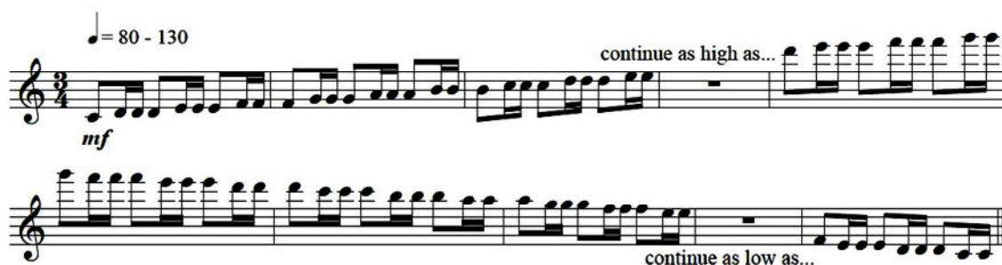
Figure 4. Sample exercise no. 2 for etude no. 2

As in the first part, the student may have difficulty tonguing the notes equally using this articulation. In this situation, they can practice every challenging passage with different tempos, articulations, notes, and rhythms using a simple exercise as suggested in Figure 4. Same type of practice can be applied also in sections from measures 33 to 40 and 49 to 52, where, once again, legato and non-legato articulations are used.