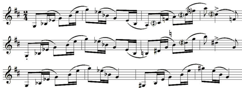
Figure 10. P. Jeanjean, Vingt Etudes Progressives et Mélodiques Pour la Clarinette, Etude No. 12, mesures from 57 to 68

Students are usually inclined to rush or slow down while playing the sixteenth and eighth notes with the given articulations in this etude. In this case, it is advisable for the student to practice these passages with a metronome, setting the beats for sixteenth or eighth notes. This sort of practice will enable students to gradually accelerate their fingering techniques while keeping rhythmical accuracy with a steady tempo. In these kind of passages in the etude, the student should pay special attention to the following elements: keeping the fingerings rhythmically accurate, keeping the legato passages clear by eliminating any middle notes that does not belong to the melodic structure, keeping the staccato notes short and on time, strong entrance to the accented notes, and coordination of all these elements with each other.