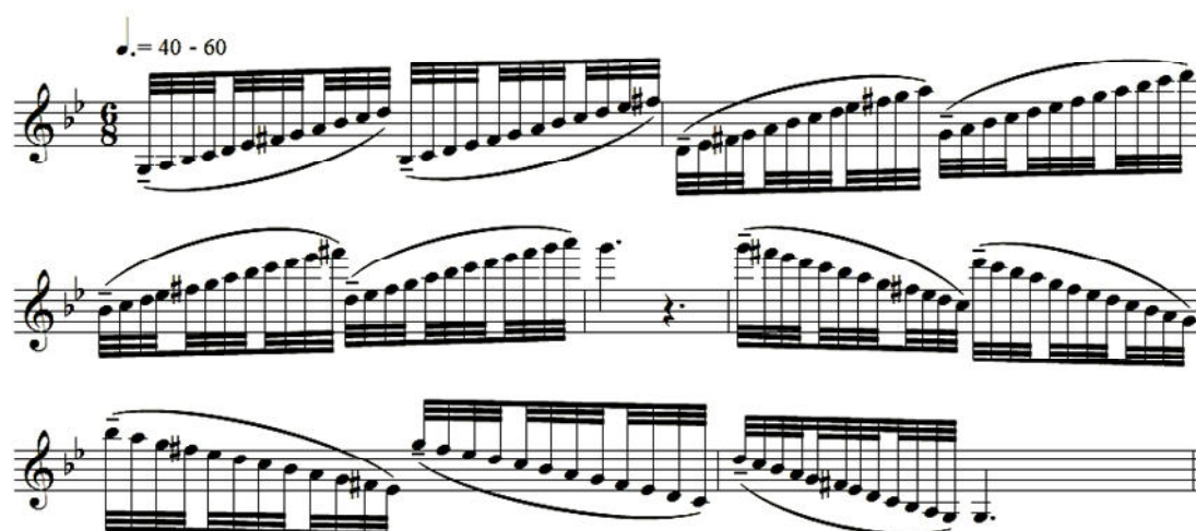
Figure 17. Sample exercise no. 3 for etude no. 19

During performance of all three exercises suggested above, the student should pay attention to acquiring rhythmical fingering of the notes in given note values and articulations, as well as performing the dynamics accurately.