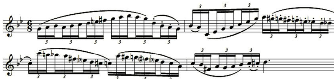
Figure 13. P. Jeanjean, Vingt Etudes Progressives et Mélodiques Pour la Clarinette, Etude No. 19, mesures from 41 to 44