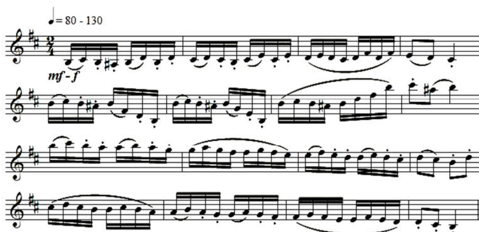
Figure 9. Sample exercise no. 3 for etude no. 12

In order to practice the combination of legato and staccato articulations in succession, the sample exercise below can be used. This is the same exercise suggested for practicing the legato passages, written with legato and staccato articulations (see Fig. 9).