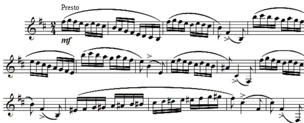
Figure 5. P. Jeanjean, Vingt Etudes Progressives et Mélodiques Pour la Clarinette , Etude No. 12, mesures 1 to 16

The student should pay special attention to keeping equal note values and a warm tone quality while performing this kind of legato passages. Furthermore, in legato passages, the student should be asked to play the notes clearly without any additional middle notes being heard. This approach would help every note to be heard clearly and equally; as a result, it would make the passages smoother. In order to practice these elements, a separate exercise similar to the exercise suggested in figure 6 can be assigned to the student.