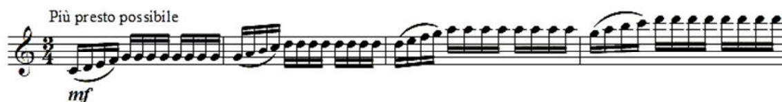
Figure 1. P. Jeanjean, Vingt Etudes Progressives et Mélodiques Pour la Clarinette , Etude No. 2, measures 1 to 4

Below is the section from measures 1 to 4, as an example to the sixteenth note passages mentioned above: