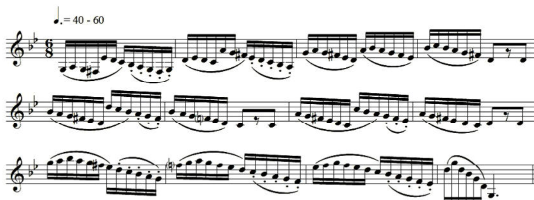
Figure 15. Sample exercise no. 1 for etude no. 19

It is advisable for the student to practice difficult sections, such as the examples above, with a metronome after breaking them into smaller sections. This style of practice would allow the student to achieve equal and rhythmical fingering and articulation of the notes. In order to develop these skills, the students can use the sample exercises below written in sixteenth notes, thirty-second notes, and sixteenth triplets (see figures 15, 16, and 17).