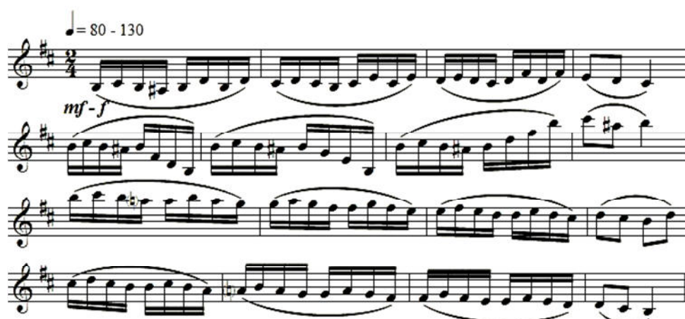
Figure 6. Sample exercise no. 1 for etude no. 12

The student should pay special attention to keeping equal note values and a warm tone quality while performing this kind of legato passages. Furthermore, in legato passages, the student should be asked to play the notes clearly without any additional middle notes being heard. This approach would help every note to be heard clearly and equally; as a result, it would make the passages smoother. In order to practice these elements, a separate exercise similar to the exercise suggested in figure 6 can be assigned to the student.