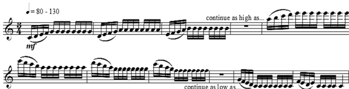
Figure 2. Sample exercise no. 1 for etude no. 2

practice not only on the notes, rhythms, and articulations written, but also on different notes, rhythms, and articulations while keeping the tempo steady. A simple exercise, as suggested in figure 2, can be used in order to improve the desired skills. These types of exercises would help the student to play the notes equally with a steady tempo, while keeping the tone color consistent.