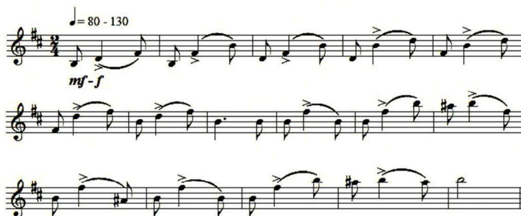
Figure 7. Sample exercise no. 2 for etude no. 12

Lastly, in order to bring out the technical and musical elements in this section, it is especially important to emphasize the accented notes clearly. The exercise below would help the student to practice emphasis of accented notes in syncopated rhythms in different dynamics and tempos (see fig. 7).