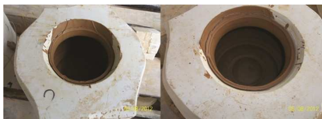
Figure 5b: Normal atmospheric pressure casting in Zutah Ceramic