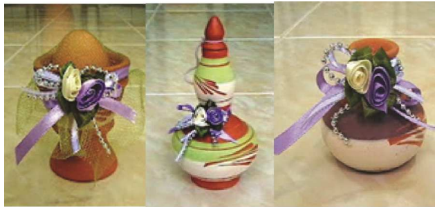
Figure 12: Packaged finished products

After firing, the wares are sorted to separate wares with defects from the successful ones. Therefore, wares without defects are package for selling or dispatch (see fig. 12).