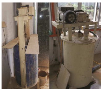
Figure 5a: Images of Plungers used in KESDEC for mixing compositions