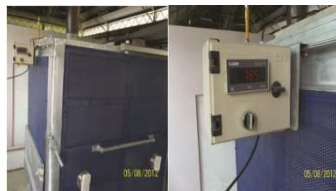
Figure 10: KESDEC's kiln under firing operation

Firing makes physical and chemical reaction takes place on the ware and gives it a fixed shape. The common kiln used by Kelantan potters is gas kiln. Glazed wares are fired to 1200°C while bisque wares are fired to 1000°C. Figure 10 shows a gas kiln at KESDEC ceramics under firing operation while figure 11 is a gas kiln at Zutah ceramics loaded for firing.