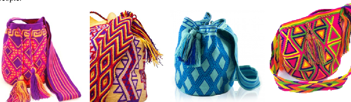
Figure 4. Examples of Kananás

Kanasü in the Wayuu language means the art of weaving or knitting patterns. Wayuu knitting is rich in these traditional designs or motifs called Kananás. This ancient technique dates back to pre-Columbian period and is used in the manufacture of pieces that for their great beauty and colour are the most valued among the Wayuu people.