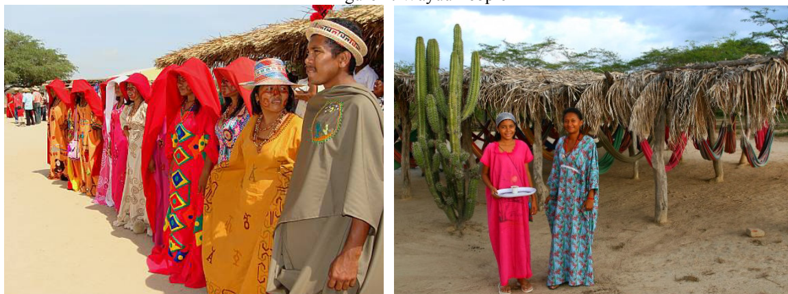
Figure 1. Wayuu People

The Wayuu are organized in clans inherited through the maternal line, each one is associated with an animal or a totem, represented using hieroglyphs, these besides being a familiar symbol is also used as a branding iron to mark the cattle. As explained by Díaz Guerra (2003) The Wayuu believe blindly in the myths and legends of their community, their life is governed by them. Dreams are extremely important, for The Wayuu dreams explain the reality of the collective and individuals, they grant them divination powers and they see them as visions of the future. The social organization of the Wayuu is strongly associated with their cosmological principles and methods of mythical representation.