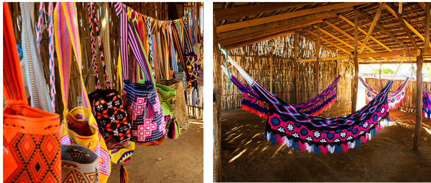
Figure 2. Wayuu woven and knitted goods

Woven and knitted goods play a fundamental role in the Wayuu Culture because they take part in almost all of their economic and social activities, in the pasturage of the cattle, social meetings, celebrations, funeral rites, traditional rites and ceremonies. Weaving and knitting are meaningful activities, besides being the legacy of their ancestors it's the way Wayuu people express how they feel about their lives and how they interpret the material world. Each woven or knitted piece carries a meaning and a history that simultaneously expresses creativity, intelligence and wisdom. Intricate and highly elaborated pieces are symbols of power and prestige.