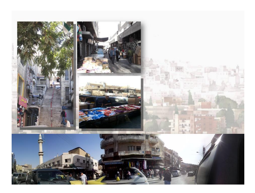
Figure 5. Movement channels in Amman city center

So the importance of spatial elements' clarity of the city and its distinction to contribute facilitating the human lives movement and communication (Figure 5).