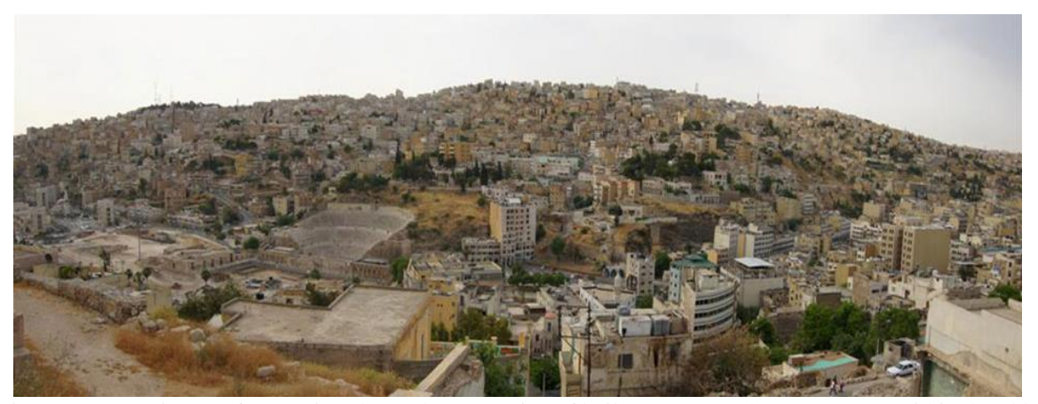
Figure 3. Determinants of expansion shows the proportion of built-up areas to the empty areas within the old neighborhoods in Amman