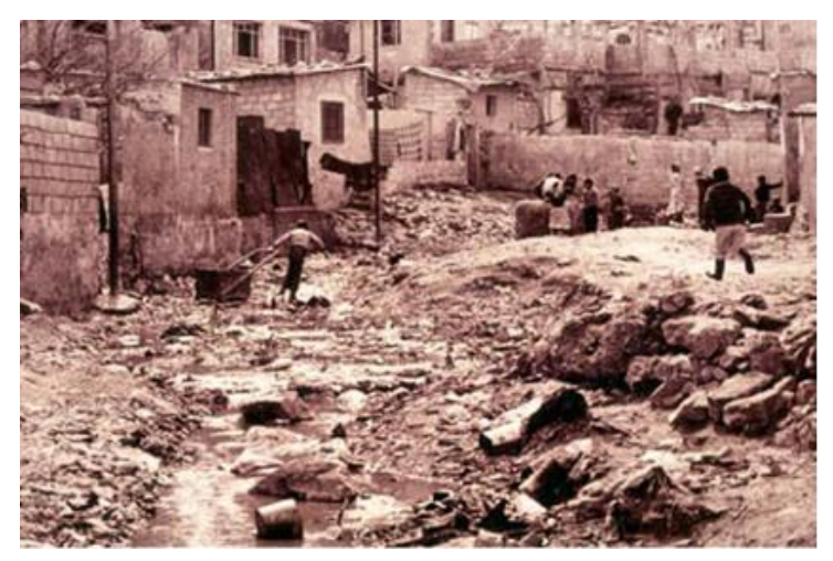
Figure 4. The behaviors obstacles in some neighborhoods of Amman