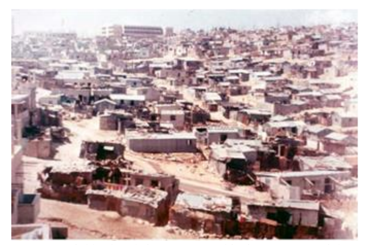
Figure 6. Poor neighborhoods in Amman and its impact on spatial complexity

The intent of simplicity, meaning it contains a simplified spatial composition which include a specified number of shapes, sizes, colors and details. While the opposite is the spatial diversity and it is the large number of those former strength and qualities, and its harmony and coherence between the different elements and its specificity. In the absence of these qualities in the spatial diversity the inconsistencies and extreme dissonance happened between its parts so the hassle makes this a kind of environment which is described as complicated (Figure 6).