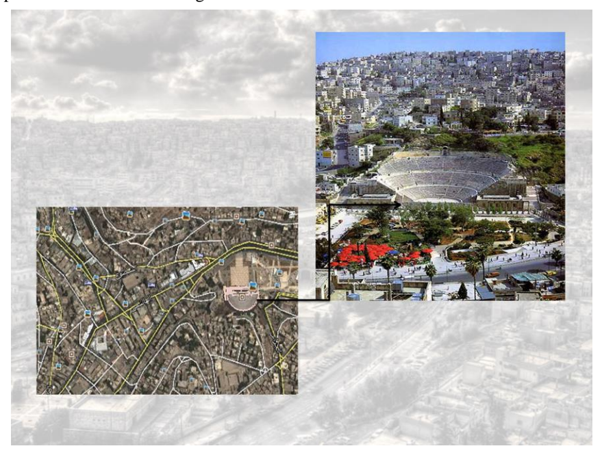
Figure 7. Amman city center and Roman Theater appears with its impact on the appearance behavior

What intended is the obvious visible behaviors to human which is viewed and linked to the actions of human external behavior with his own built environment and his affiliations and which is useful to determine his direction and personal behaviors as in figures 7 and 8 which these behaviors are divided into the following: