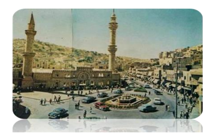
Figure 8. Al-Hussaini mosque in Amman city center appears with its impact on the appearance behavior in 1966