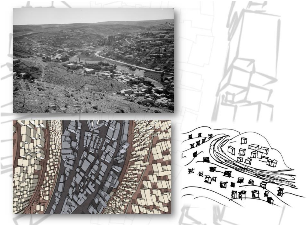
Figure 9. Urban nature (grid random)

The spatial systematics is the capacity of the built environment in the formation of spatial gradation-behavioral aims to coordinate the population activities and identify it in certain ranges based on the nature of the urban planning and its impact on individuals' behavior and their relationship to the empty areas (Figure 9).