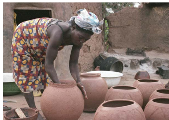
Plate1. Indigenous production technique