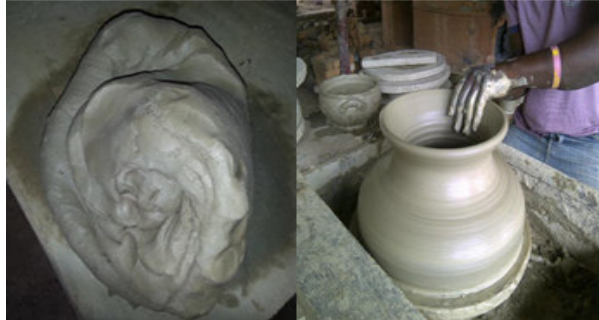
Plate 5. Preparation of the neck

1. A ball of clay was prepared, centred on the potter's wheel and thrown to produce the neck of the vase.