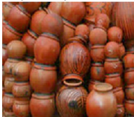
Plate 3. Indigenous pottery wear in different sizes and shapes