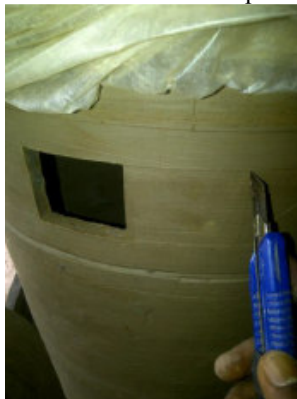
Plate 12. Cutting out the square shapes