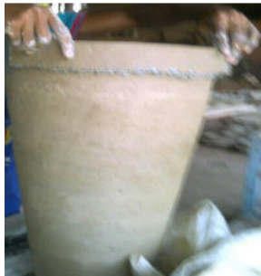
Plate 10. The neck of the pot