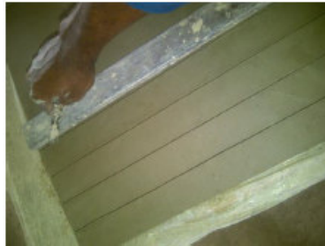
Plate 9. Slabs of clay.