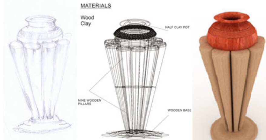
Figure 1. Working drawings for project two