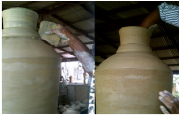
Plate 11. Joining the neck to the base.