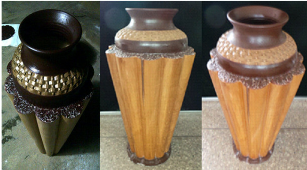
Plate 8. Finished integrated clay and wood flower vase.