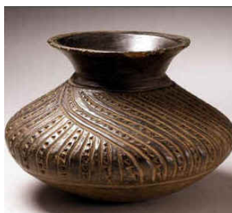
Plate 5: Traditional Pottery, source from http://gidconsult.gidconsult.org

The traditional pottery is the benchmark product of women's co-operatives such as the Kpando and Vume Women's groups of the Volta Region, and the Otabenaze group of the Central Region.