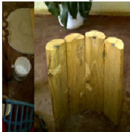
Plates 7 Pieces of wood cut into cylindrical form.

5. With the aid of lathe turning machine, 9 pieces of wood were turned into the shape of a cylinder with the top measuring 4.5inches and the bottom 2.5 inches with a height of 24 inches.