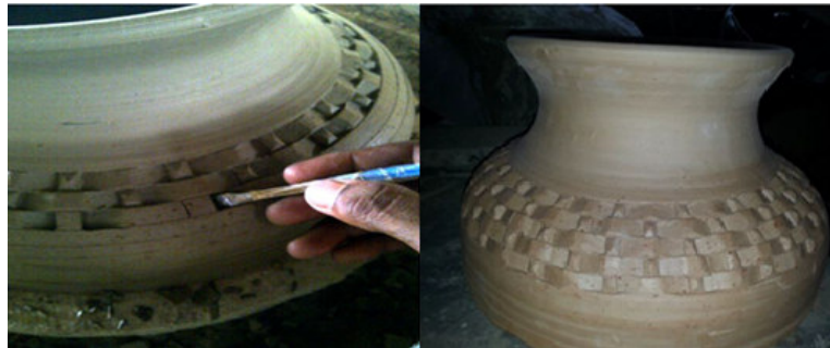
Plate 5. Woven designs carved around the neck of the pot.

4. With some carving tools, Woven designs were drawn and carved out around the neck within the 5cm marks drawn, as a means of decoration as in plate 5, and then left to dry thoroughly, after which it was fired.