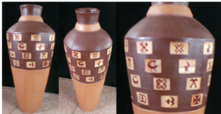
Plate 13: Finished integrated clay and wood vase.