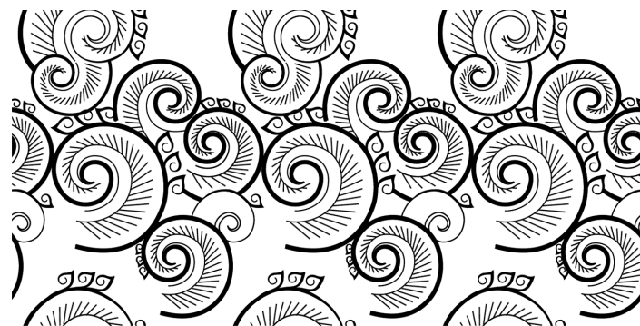
Figure 9. The primary ornament ( klowongan ) with secondary ornaments ( isen ) to fill in the primary parts (Designed by Wardani, 2015).