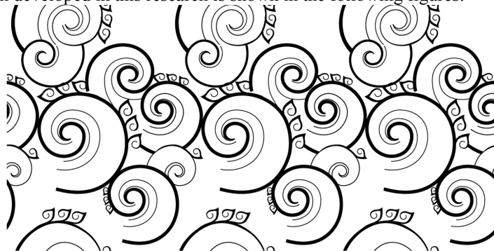
Figure 8. The primary ornament ( klowongan ) forms the main batik pattern arrangement. This klowongan was inspired by the tendrils found on the candi (Designed by Wardani, 2015).

Generally, a batik pattern consists of three main elements: klowongan , isen-isen and pengisi . Klowongan is the primary ornament or pattern, isen-isen or isen is the content pattern of the primary ornament ( klowongan ) while pengisi is the additional filling or background pattern that functions as a balance to the primary ornament in order to produce a harmonious combination (Doellah, 2002). An example of batik motif pattern and composition developed in this research is shown in the following figures: