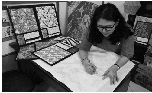
Figure 7. Pattern making process on the Mori Primisima cloth (Photo: Author, 2015).

Generally, a batik pattern consists of three main elements: klowongan , isen-isen and pengisi . Klowongan is the primary ornament or pattern, isen-isen or isen is the content pattern of the primary ornament ( klowongan ) while pengisi is the additional filling or background pattern that functions as a balance to the primary ornament in order to produce a harmonious combination (Doellah, 2002). An example of batik motif pattern and composition developed in this research is shown in the following figures: