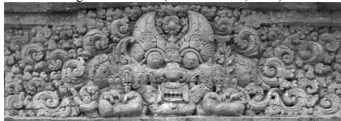
Figure 3. Kalamakara Motif on Candi Bajang Ratu, surrounded by typical Majapahit ornaments of spreading tendrils.