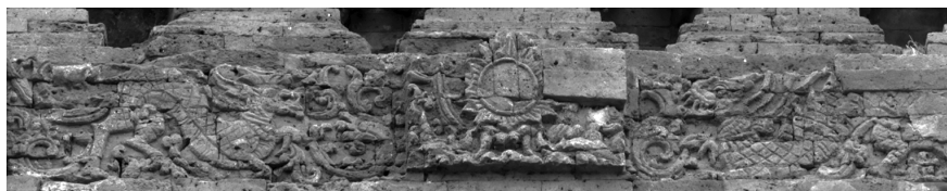
Figure 5. Sun relief/Majapahit sun motif flanked by clawed-dragons in Candi Bajang Ratu.