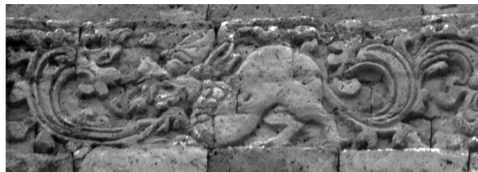
Figure 4. Lion motif on Candi Bajang Ratu (Photo: Author, 2015).