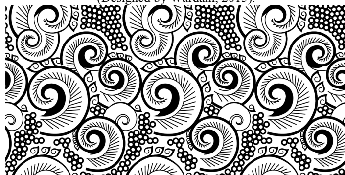
Figure 10. The primary motifs and patterns have been given additional patterns surrounding them ( pengisi ) that act as a background to balance the primary ornaments (Designed by Wardani, 2015).

Following the motif and pattern arrangement making stage, the experimental activities were followed by the process of batik making using the canting (a spouted tool used to draw patterns with wax on batik textiles).