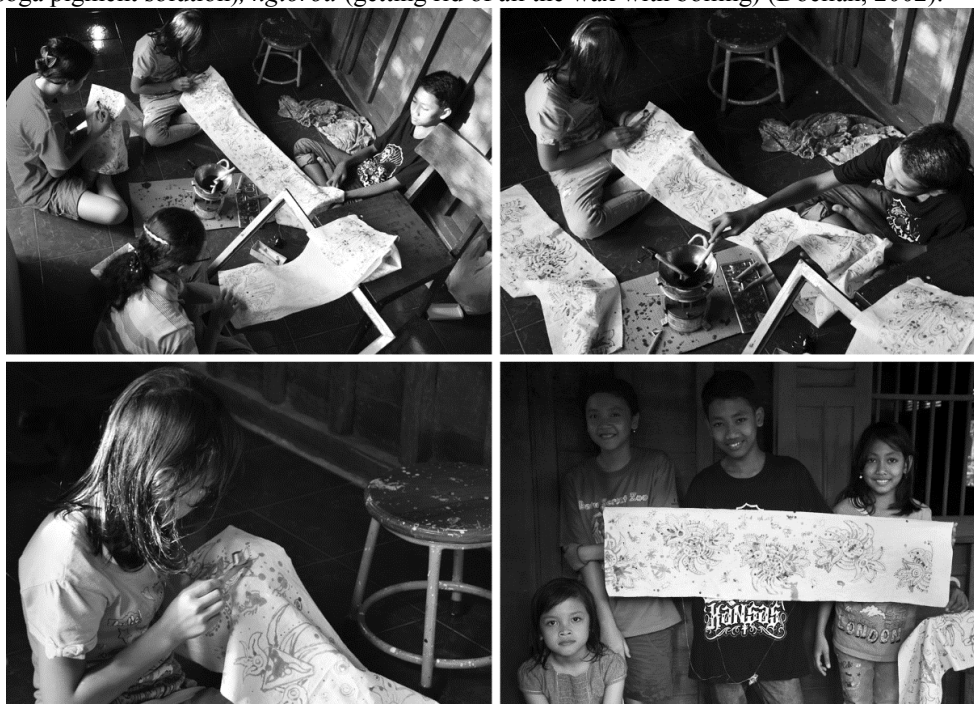
Figure 11. Practice in making mbatik klowongan patterns with primary 5 and 6 school children in the researcher's home. The technique of batik making needs to be introduced to the young generation from childhood. The skills of batik making are passed down through demonstrations and verbal explanations. The study process was developed through looking, observing and direct practicing on site.

The mbatik pesisiran process was used in the experiment of this research consisting of: mbatik (making patterns on the mori or cloth by applying batik wax using canting tulis ), nyolet (giving colour to certain parts by dabbling coloured pigment solutions on those parts), nutup (covering the parts that have been dabbed with batik wax), ndhasari (soaking the background pattern with desired coloured pigments), covering of the dasaran (covering the areas of the background pattern that has already been coloured), medel (soaking in blue colour), nnglorod (getting rid of all the wax on the mori or cloth in a tub of boiling water and yielding coloured kelengan ), nutup and granitan (covering the areas that has been coloured and the parts that would be left white as well as making white dots on the lines outside the outer pattern known as granit with batik wax), nyoga (soaking in brown or soga pigment solution), nnglorod (getting rid of all the wax with boiling) (Doellah, 2002).