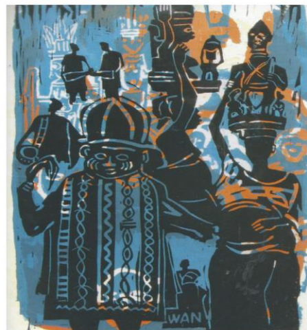
Fig. 4: Festival of the Gods Etching 47cm x 32cm Private Collection 1987.