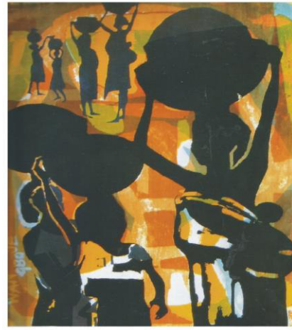
Fig. 2: Romance of the Hedload III (Linocut 43cm x 33cm Private Collection 1978) Source: Artist of Nigeria