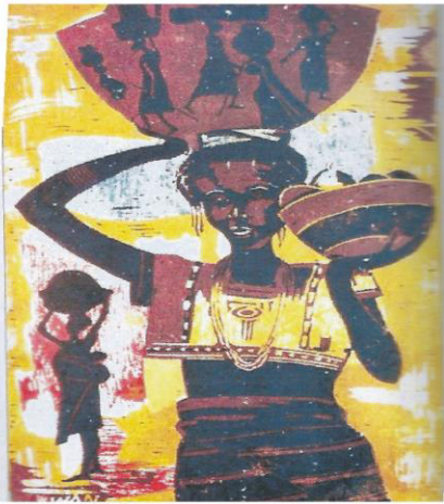
Fig. 1: Romance of the Hedload II (Serigraph 48cm x 32cm 1978)