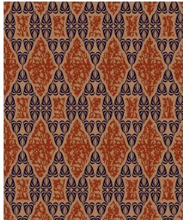
Plate 5.10: koklokoko [Dressing of chicken]

The background exhibits bubble effects, with diagonal and horizontal lines as well as varied dots used as textures. The dark-brown, blue and orange colours depict harmony to balance the motifs arrangements; which shows the recurring effect of the motifs. The brown colour signifies nature, earth and the solid land on which the people live. The orange denotes confidence, creativity and fun lovers among the Ewe people. The blue also signifies responsibility, morality and spiritual sanctity demonstrated by the people.