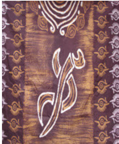
Plate 5.2: "Lòlòsako" [love knot]

Two yards of plain cotton fabric was used in executing this design. Circular sketch were made at the neckline and the "love knot" symbol sketched at both sides of the folded three yard cloth with a pencil. The pencil marks were resisted with molten wax using latex foam. The selvages of the fabric were resisted with the cowry motif stamp. After the wax work was completed the fabric was dyed in yellowish brown vat dye liquor in the proportion of 1\frac{1}{2} tablespoons of yellow dye and \frac{1}{2} tablespoon brown dye. Selected portions in the fabric were waxed again after oxidation and drying. The fabric was then dyed in reddish violet vat dye for 15 minutes, removed for oxidation, rinsed, dewaxed, washed, dried and finally ironed. The result is shown in as in Plate 5.