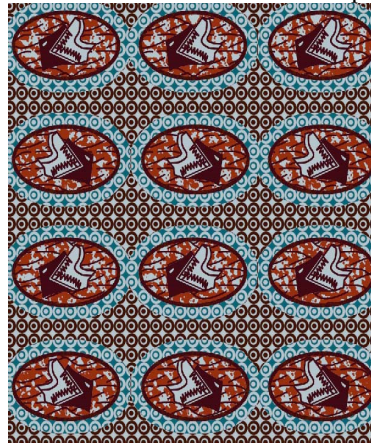
Plate 5.12: Avuto [Dog owner]

undulating horizontal lines with diamond shapes. Around the main motifs is formed a light blue ring of shadow creating a sense of colour harmony. The motif was derived from the proverb “Avu ɔnaa vuto” that is, a dog can bite its master. A dog is a humble and obedient creature but reacts unexpectedly when provoked.