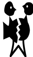
Fig.4.10: Tōmedela (water drawer)

10. Tōmedela ye gba na ze. [Only the one who kindly accepts to fetch water may unwillingly break the pot.] The symbol depicts water fetchers with broken pot.