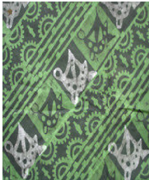
Plate 5.1: “Aba vuvu” [worn-out bed]

The waxed fabric was again dyed in brown vat liquor for 15 minutes. The fabric was removed, oxidised and rinsed in cold water followed by dewaxing. The fabric was finally dried and ironed as seen in Plate 5.1.