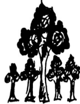
Fig.4.1:Ati d̄eka (One tree)

A single tree in the proverb refers to an influential, prominent elderly or rich person in society e.g., a King, President or Chief. The forest also refers to an institution, family or community. The proverb therefore depicts that a rich or prominent person alone cannot constitute a family, region, state or nation. There are forest areas in the Ewe land, and during the farming season it calls for communal spirit and team work. The symbol depicts a big tree surrounded by four small ones on its sides.