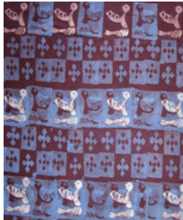
Plate 5.3: “Nu Yequto” [The beggar]

The fabric after waxing was dyed in blue vat liquor. After dyeing the fabric was removed from the dye for oxidation and dried. Portions of the dried fabric were waxed again using the engraved wooden stamp to fill in-between the relief stamps. In-between the horizontally motifs was resisted with stamps made of engraved and relief motifs. Finally the fabric was dyed again in a brownish violet vat dye. The dye was mixed in the proportion of one (1) tablespoon of red and one (1) tablespoon of brown with the corresponding chemicals.