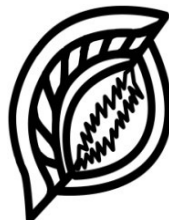
Fig.4.7: Agaga lolo (the big cowry)

7. Agaga lolo me fle na agaga eve fe nu o. [One big cowry cannot be used to pay for two cowries.] The symbol depicts one big cowry.