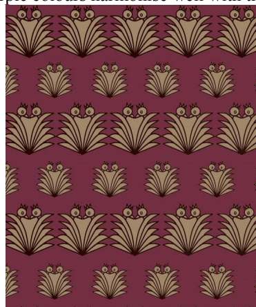
Plate 5.13: “ɲkukɔ la” [The observer]

The design in Plate 5.13 is titled “ɲkukɔ la” that is, the observer. It is derived from the proverb “Koklotsu eve wo le adzre wɔm, gake wo le wonɔwofenku kɔm” meaning, two cocks quarrelling are mindful of each other’s eye. The motif was arranged in a half drop pattern. It comprises two abstract cocks facing each other as the repeat unit. The unit repeat comprises of a large and small motifs alternating in half drop repeat pattern. The cream colour, dark brown and light purple colours harmonise well with the design.