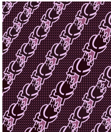
Plate 5.11: Ade ḡitsa [Experience hunter]

Plate 5.11 is titled “ḡitsa” which means, experience was derived from the proverb “Adeḡitsa kple lāḡitsa ye do na go” translates an experienced hunter will surely meet a very experienced wild animal (fig.4.9). The motif was arranged in a diagonal pattern formation. The background comprises of diagonal and horizontal lines and dots used as textures. The dark-brown, light violet depicts harmony to balance the motifs arrangements; which shows the recurring effect of the motifs.