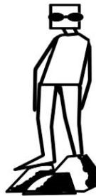
Fig.4.6: nkugbagbatọ (The blind person)

The symbol depicts a blind person with the foot on a stone.