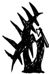
Fig.4.2: Mumu dzrom. (Destroyer)

The tree is used here to depict a humankind whereas the axe also used here as a corrective tool. Therefore if a person does things wrongly the tool is used as a standard for correction. The axe is used to cut or prune down trees that go beyond bonds and that which cannot able to bear fruits. The symbol depicts a partly chopped tree branch with an axe.