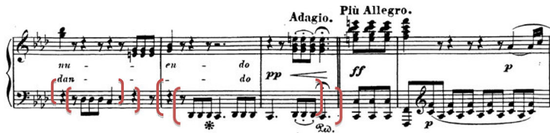
Figure 6: The Presentation of Fate Motif in Piano Sonata No. 23, Before Coda Sonata No. 23 Op. 57 Measures 242-246

Due to the form structure of the section, the motifs above are seen in the same way in the réexposition section. Additionally, this motif also appears in the passage to the coda section and in coda.