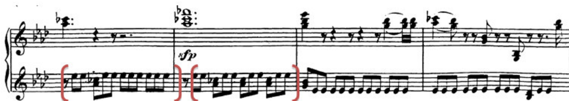
Figure 11. Piano Sonata No. 23, The Reflection of Fate Motif Sonata No. 23 Op. 57 Measures 26-29

Musical development up to this point, is the first example of the contradiction that dominates the section generally. Following themes are the reflections of these two characters or they are formed as the sub-meanings of them. The first example of this is the trios related to the fate motif. They are not the same as the motif structurally; however, its musical expression reminds the fate motif. The tension it creates, music's being anxious and fearful; and also theoretical similarities with the fate motif present the expression of fate idea in a different way in this passage of the section.