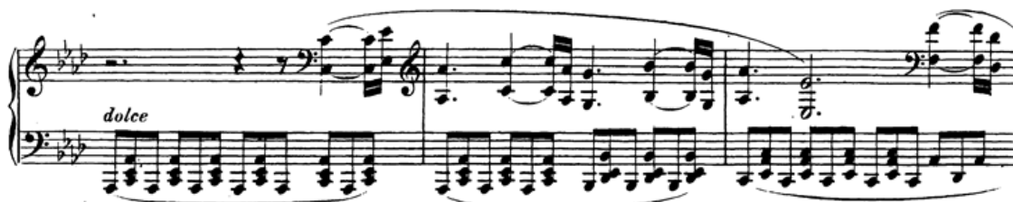
Figure 12. Piano Sonata No. 23, The Reflection of the Fate Motif Contradiction Sonata No. 23 Op. 57 Meters 36-38

However, this calmness does not last for long and the tension reoccurs when the following trill is heard. As a result of this, the point, where the tense music reaches, is again the magnificent theme where the fate motif exists. (See: Figure 4). The effect of the fate thought in that passage of the section lasts for longer through the existences of trios which follow and remind the fate theme. What is experienced at this point is that the contradicting response also gets longer in conjunction with the length of this effect. This situation causes contradicting response to be stronger and determinant musical character and makes the themes which are happy and peaceful in the beginning of the section more severe and persistent.