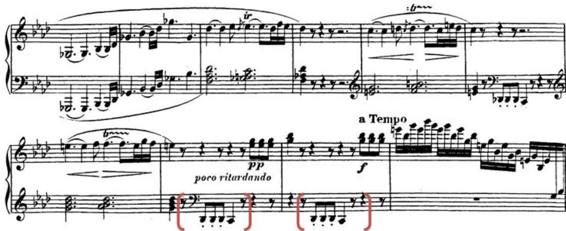
Figure 3: Presentation of Fate Motif in Piano Sonata No. 23.

One of the two contradicting themes stated in this review is the theme with the same rhythmical properties with fate motif which is heard right after the introduction of the section and played with bass voices.