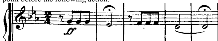
Figure 2: Beethoven's Fate Motif, Its Structure and The Representation of The Activity of Knocking The Door 5th Symphony Measures 1-5

This fate motif heard in the introduction section of symphony first constitutes the musical construction of the first section. In other words, the first section of the work was created on this motif. The structure of the motif is quite minimal and Beethoven tried to describe the action of knocking the door of the fate by using music. Therefore, rather than being melodic, the motif is encountered as a rhythmical figure. As it can be seen in the figure below, each eighth note represents the correspondence of the action of knocking on the door; long notes represent the stopping point before the following action.