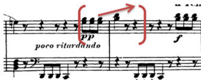
Figure 8: Piano Sonata No.23, The Motif which Moves in The Opposite Direction of Fate Motif Sonata No. 23 Op. 57 Measures 13-14

We encounter this second motif in a responding manner almost every time right after the fate motif is heard. What is clear about this motif is that it provides a maintenance for the music with a characteristic which creates an explosion after that. When the general musical structure of the section is analyzed, it is seen that these two contradicting structures create a repulsion towards each other whenever they meet.