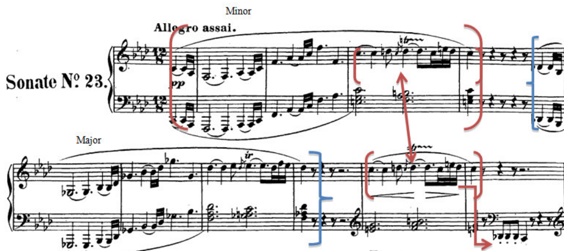
Figure 9: Piano Sonata No.23, 1 st and 2 nd sentence structure, Fate Motif Combination Sonata No. 23 Op. 57 Measures 1-11

The motif which comes right after the fate motif and responds it represents the correspondence of not adopting and the sudden forte tone in the following creates a certain rejection idea.