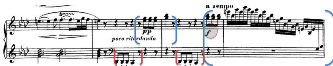
Figure 10: Piano Sonata No.23, Fate Motif and Rejection Movement Sonata No. 23. Op. 57 Measures 12-15

The motif which comes right after the fate motif and responds it represents the correspondence of not adopting and the sudden forte tone in the following creates a certain rejection idea.