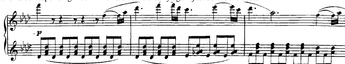
Figure 14: Piano Sonata No. 23, Resistance Beginning before the Coda Sonata No. 23 Op. 57 Measures 216-218

Being persistent of this contradicting response increases the musical dynamic by prolonging the resistance situation. Consequently, the contradiction in the section is transferred from piano tone to the forte tone and changes towards the deepness and chaos created by the themes which have the capacity to push each other. However, Fate motif takes the place of the persistent contradicting response and presents itself in the increasing dynamic of the section through forte tone (See: Figure 5). The music enters the réexposition passage through the following trios and the first sentence of the section along with them. Same musical dynamics preserve their existence in the réexposition passage, as well. From this point on, the change in the musical expression happens before the coda. The most persistent and so-called aggressive resistance in the section is seen in that part. This corresponding resistance, which is peaceful and starts in a major tone, towards the mood reflected by fate motif has an increasing dynamic here as it has in the other parts of the section. This resistance continues till the fate and its corresponding motif which are heard clearly again just before the coda.