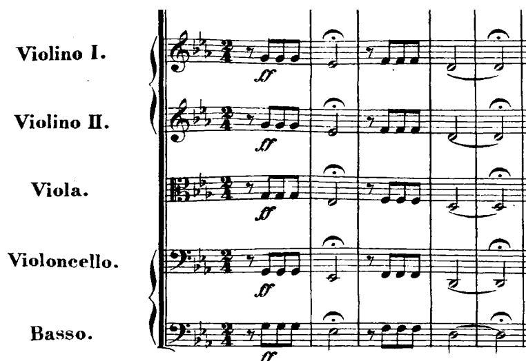
Figure1: Beethoven's Fate Motif – 5th Symphony Measures 1-5