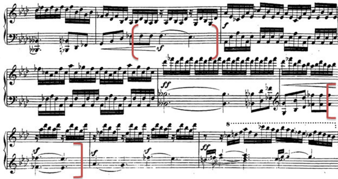
Figure 4: The presentation of Fate Motif in Piano Sonata No. 23 Sonata No. 23 Op. 57 Measures 55-63