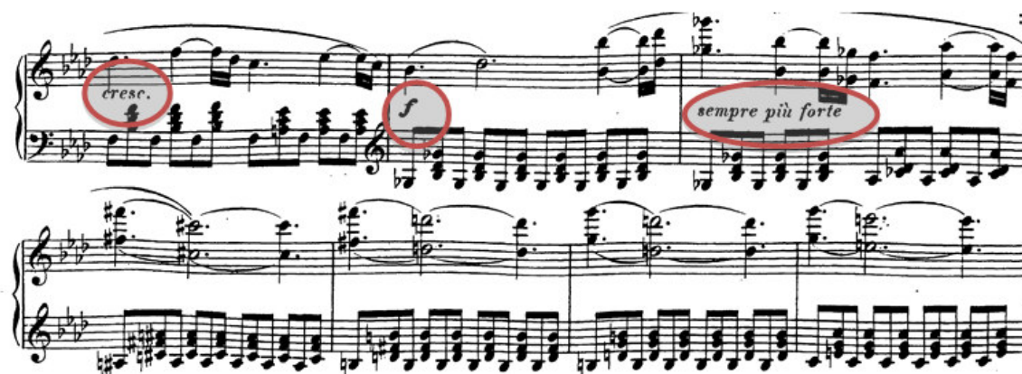
Figure 13. Piano Sonata No. 23, Musical Character of Contradiction of Fate Motif Change Sonata No. 23 Op. 57 Measures 113-119

However, this calmness does not last for long and the tension reoccurs when the following trill is heard. As a result of this, the point, where the tense music reaches, is again the magnificent theme where the fate motif exists. (See: Figure 4). The effect of the fate thought in that passage of the section lasts for longer through the existences of trios which follow and remind the fate theme. What is experienced at this point is that the contradicting response also gets longer in conjunction with the length of this effect. This situation causes contradicting response to be stronger and determinant musical character and makes the themes which are happy and peaceful in the beginning of the section more severe and persistent.