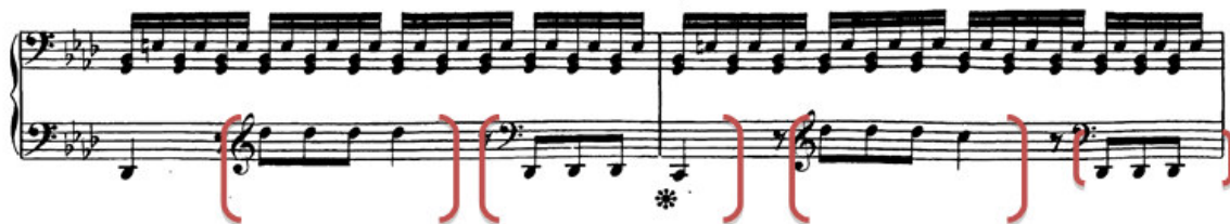
Figure 5: The presentation of Fate Motif in Piano Sonata No. 23 Sonata No. 23 Op. 57 Measures 135-136

Due to the form structure of the section, the motifs above are seen in the same way in the réexposition section. Additionally, this motif also appears in the passage to the coda section and in coda.