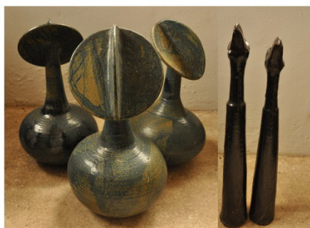
Figure 3. Birds forms