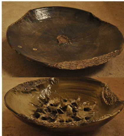
Figure 9. Engobe coating