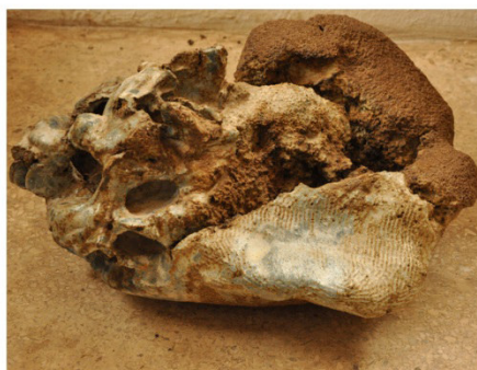
Figure 5. Rock