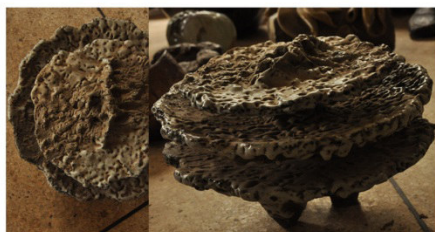
Figure 7. Crater glaze textures