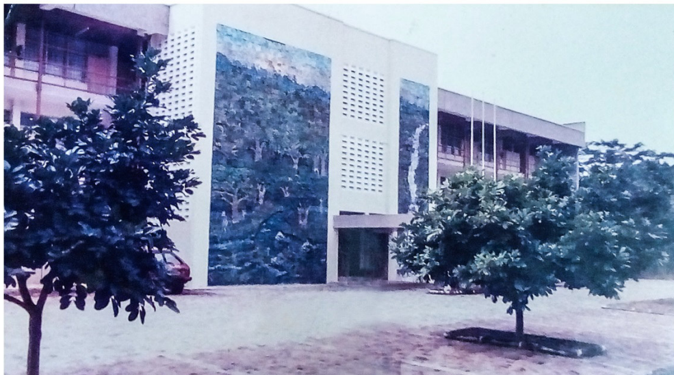
Figure 11. Ceramic mural mounted on the administration block of Forest Research Institute of Ghana at Fomesua