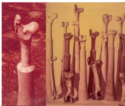
Figure 1. Bones

Art and Perception. No 103 Provencal, E.N.D. (1991, March 16). The ceramic superb. The Mirror.