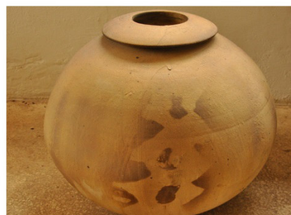
Figure 8. Matt effect