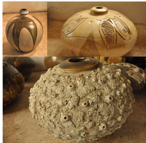
Figure 10. Pots