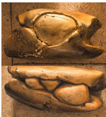
Figure 4. Tea bread forms