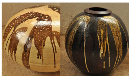
Figure 6. Poured pattern glaze