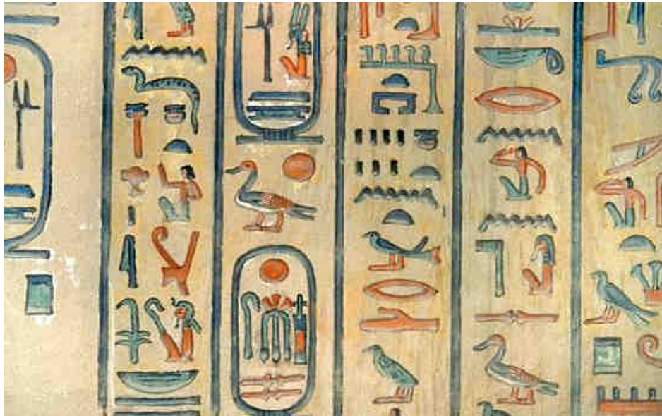
Figure 1. An Egyptian hieroglyph