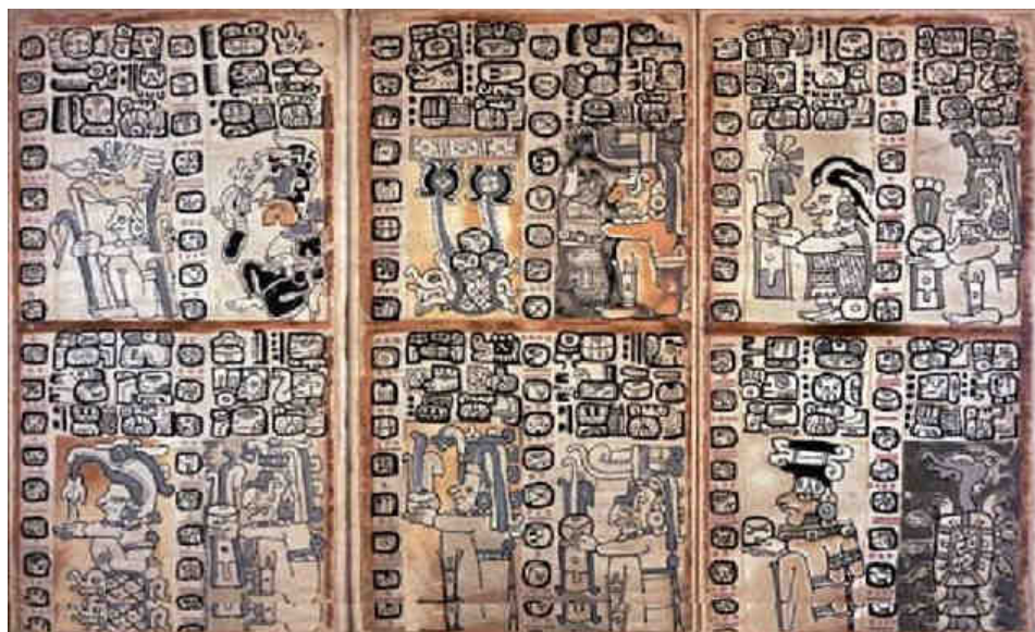
Figure 2. The Madrid Codex: Maya hieroglyph

There is, in fact, scarcely any human endeavour that does not subscribe to the munificence of visual elements in its daily operations. Visuals are a very vital feature in communication, be it primitive or modern, analogue or digital. Graphic design, therefore, takes full advantage of this important factor. Warner (2009) submits that graphic design is principally about visual communication, information and persuasion using print and electronic media. Today, technology has allowed for access to visual media such as digital media, video games and television in a way that young adults have integrated these media into their daily lives (Glore, 2010). Evidently, visual elements thus have a