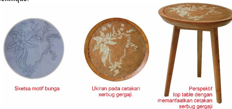
.Figure 4: tabletops using the carved material.

mixture has dried and hardened. The hardness of the dried products mean that it can carved on. The hardness of the material is comparable to white stone. The recommended technique is the lemahan technique, and the material is incompatible with the krawangan technique. The following are the usage of sawdust on a table top using the lemahan technique.