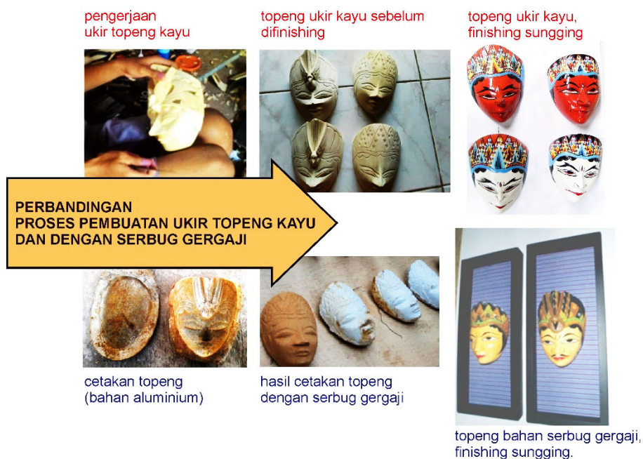
Figure 3: comparison between production processes of wood-based and sawdust-based mask products

One of the more important part of production is its economic value. The calculation of economic value was done on wood-based and sawdust-based mask crafts. The masks were molded, so the work can be done on a larger scale. Overall, the process or time needed is relatively shorter. The price of material used are also cheaper. The comparison between production costs of sawdust and wood masks are 1:2.3, which means that the sawdust masks are a lot cheaper to make.