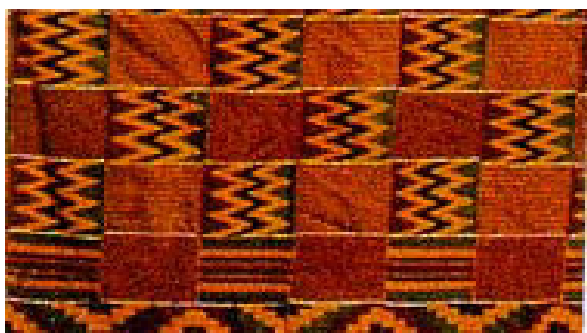
Figure 2: Sika Futuro (Gold Dust) – Asante, Ghana