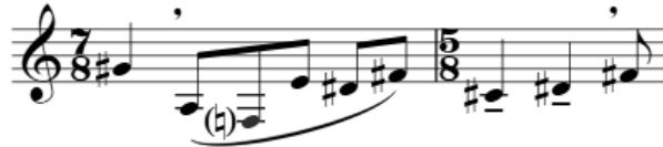
Example 3. I. F. Stravinsky, Three Pieces for Clarinet Solo, The First Piece, measures from 5 to 6

Stravinsky described these breath marks to the clarinetist, Rosario Mazzeo, in this way: "Each breath is not just so much exact time; its length depends on the moment in the music." (Mazzeo, 1991 cited by Rice, 2017, p. 240).