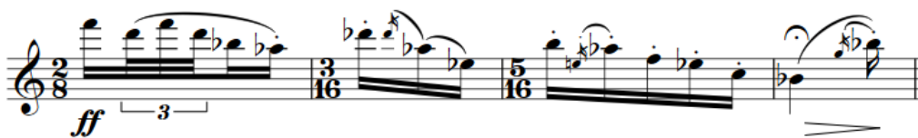
Example 10. I. F. Stravinsky, Three Pieces for Clarinet Solo, The Third Piece, measures from 58 to 61

The piece lasts for 61 measures. Crescendo, decrescendo, forte and fortissimo are used as nuances. However, when the piece is considered as a whole, forte nuance is dominant all over the piece as stated by the composer. The last note of the last measure should be noted (see example 10). Sombrier le Son Subito (abrupt change in tone color) in the 13 th , 37 th and 52 nd measures in the piece, accent notes, the spots where crescendo and decrescendo nuances are significant spots to reflect the character of the piece. The grace notes should be performed carefully as they should in the other pieces.