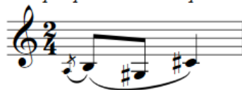
Example 2. I. F. Stravinsky, Three Pieces for Clarinet Solo, The First Piece, measure 1

Legato is used as articulation almost throughout the whole piece. While performing this articulation, breaths should not be taken except from the breath marks and the sounds should be played smoothly along with this