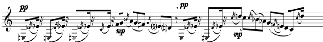
Example 8. I. F. Stravinsky, Three Pieces for Clarinet Solo, The Second Piece, Fourth Staff

The mezzo-forte nuance that starts in the beginning of the piece continues till the double lines in the middle of the piece. To perform the notes in the maximum octave in a controlled way along with the aforementioned nuance until that piece is significant in terms of both musicality and the continuation of the nuance. In addition to all these, a clear intonation should be noted. After the double line, sounds in low octave that start with a pianissimo nuance are in chalumeau tessitura in septet intervals and right after it, it includes a mezzo-piano nuance response with graces and expressions (see example 8). While playing these sections accompanied with nuances, the question – respond relation should not be ignored. One more pianissimo and mezzo-piano nuance change after these nuances, the piece continues with subito pianissimo, mezzo-piano and mezzo-forte nuances and it ends with a ritardando along with subito meno forte nuance.