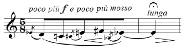
Example 4. I. F. Stravinsky, Three Pieces for Clarinet Solo, The First Piece, measures from 29 to 30

The tranquility until the 28 th measure of the piece is disturbed with the sudden poco piu f e poco piu mosso in the last two measure of the piece (see example 4) and preparation for the second piece starts. The breath should be blown to clarinet by being increased gradually with the help of diaphragm for each of the piano nuance along with the crescendo nuance for eight times that have continued for 28 measures. On the other hand; the breath should be blown to clarinet by being decreased gradually with the help of diaphragm in decrescendo nuance. All in all, musical integrity is important throughout the piece.