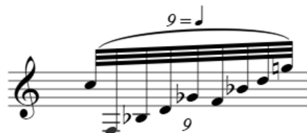
Example 7. I. F. Stravinsky, Three Pieces for Clarinet Solo, The Second Piece, Third Staff

The mezzo-forte nuance that starts in the beginning of the piece continues till the double lines in the middle of the piece. To perform the notes in the maximum octave in a controlled way along with the aforementioned nuance until that piece is significant in terms of both musicality and the continuation of the nuance. In addition to all these, a clear intonation should be noted. After the double line, sounds in low octave that start with a pianissimo nuance are in chalumeau tessitura in septet intervals and right after it, it includes a mezzo-piano nuance response with graces and expressions (see example 8). While playing these sections accompanied with nuances, the question – respond relation should not be ignored. One more pianissimo and mezzo-piano nuance change after these nuances, the piece continues with subito pianissimo, mezzo-piano and mezzo-forte nuances and it ends with a ritardando along with subito meno forte nuance.