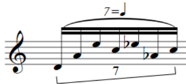
Example 6. I. F. Stravinsky, Three Pieces for Clarinet Solo, The Second Piece, Second Staff

The composer wanted septuple notes on the second staff and nontuple notes on the third staff to be considered as: a septuple = a quarter, nontuple = a quarter (see example 6,7). The practice that is done for semi-quaver trios can also be done for septuple and nontuple notes. It should be provided for these kinds of sections that the notes should be played piece by piece and completely with a comfortable finger technique. As it is in the first piece, there are also grace notes in this piece. In order not to disturb the tempo, it is also important to key the graces in time. The suggestions related to grace note in the first piece can be employed in this piece, as well.