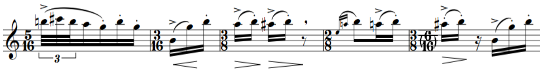
Example 9. I. F. Stravinsky, Three Pieces for Clarinet Solo, The Third Piece, measures from 4 to 8

The piece lasts for 61 measures. Crescendo, decrescendo, forte and fortissimo are used as nuances. However, when the piece is considered as a whole, forte nuance is dominant all over the piece as stated by the composer. The last note of the last measure should be noted (see example 10). Sombrier le Son Subito (abrupt change in tone color) in the 13 th , 37 th and 52 nd measures in the piece, accent notes, the spots where crescendo and decrescendo nuances are significant spots to reflect the character of the piece. The grace notes should be performed carefully as they should in the other pieces.