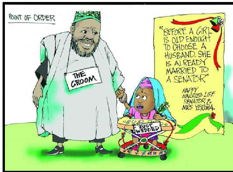
Figure 1: Point of Order. (2013). Cartoon showing Senator Yerima's Wedding with a minor.