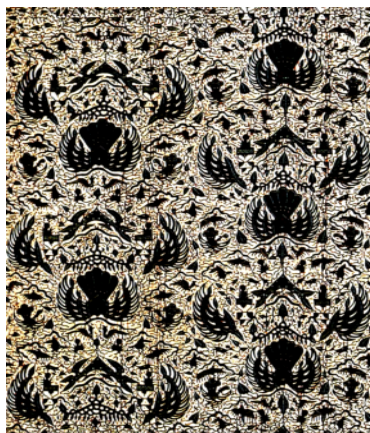
Picture 3. Classical pattern batik is imitation batik (Javanese: tiron, putran ). Remeng batik with black ground is called remengan (gurdan) batik (Surakarta style) while its white ground counterpart is called Sidomulyo (Yogyakarta style).

position, di the right-life of the top and the top there are three building motifs upon which is meru motif combined with bird motif. It seems that all of them guard the existence of the tree of life.