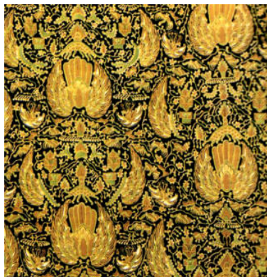
Picture 4. Batik production is no more entirely referring to classical batik, and both coloring and both work techniques are free and utilizing synthetic coloring materials, and philosophically refers to conservational revitalization concept. (Collection of H. Santosa Doelah, 2002, scan repro: Kartika, 2015)

Although creative pattern batik is still produced in reference to traditional batik (see Semen Rama creative pattern batik) and structurally is still referring to traditional pattern, the creative pattern batik is not entirely imitating the traditional. For example: Semen Rama batik shown above has no more 9 motifs (8+1) but less in number, so it does not represent hasta brata principle that philosophically belongs to revitalization concept ( tanggung ).