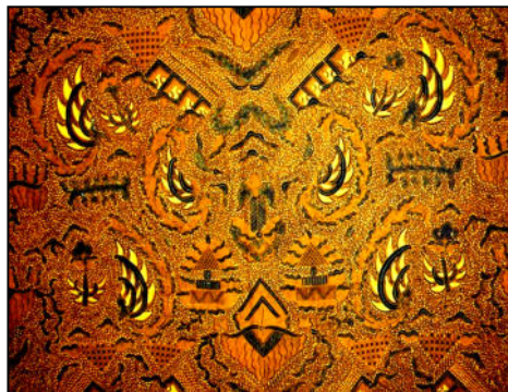
Picture 1. Semen Ramawijaya Batik, approached by the concept of Tribuana/Triloka and mandala, illustrates the relationship between universe or underworld ( alam sakala ) to move towards Oneness ( alam niskala ) through middle universe ( alam sakala niskala ), which bring about the balance, harmony, and unity while each of them gives power/energy centrally.

From Javanese cultural view semen ramawijaya is beautiful and displays tuntunan (guidance) in its classical motif (based on the concept of Triloka/Tribuana and Mandala). It is as if Semen Ramawijaya batik painted to be seen from above, tree of life is appeared to be surrounded by other motifs. The pattern composition of Semen Ramawijaya batik is motifs combination that consists of tree of life, garuda motifs in left-right sides, under the tree of life is a pair of structures motif under which is a pair land animals motif. With regard to the philosophical concept of Tribuana/Triloka, the tree of life motif as the illustration of intermediary world or middle world ( niskala-sakala universe) is a counter balance/link between underworld ( niskala universe)— through middle world ( sakala-niskala universe)—and upperworld ( niskala universe).