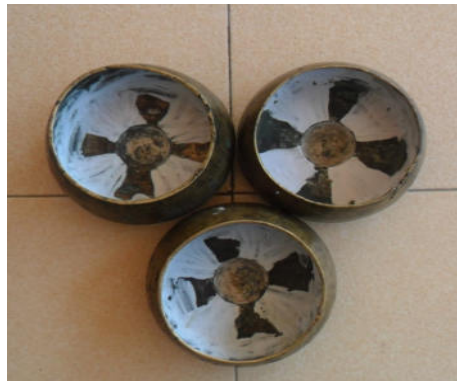
Picture 3. Pattern of manyadahi talempong

The purpose of using sadah to adjust the sipongang of the talempong is to improve its aesthetical quality in accordance with the wishes of the talempong elders. This not only involves a physical procedure but must also be accompanied by the non-physical element of the ritual, which talempong elders believe to be of great importance. Efforts to improve or maintain the sipongang sound of the talempong are required in order to preserve the aesthetical quality of the talempong sound.