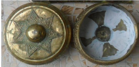
Picture 1. Physical structure of the talempong, sound source, and resonating chamber

Aesthetically (in terms of beauty), the relationship between the subject and object places more emphasis on the construction of the ritual in connection with the sadah and the talempong – specifically the physical quality of the material object. The physical quality of the talempong and the sadah play an important role in altering the aesthetic quality of the talempong sound. The sound source of the talempong is the momong , or pencon (bossed knob) on top of the instrument. The talempong will produce a sound when the mallet ( pangguguah ) touches the momong with a particular force. When the momong produces a sound, the entire physical structure of the talempong also vibrates. This vibration causes the air around the sound source to vibrate. The vibration in the air caused by the momong is influenced by the resonating chamber, or the physical shape of the cavity inside the talempong. The resonating chamber and physical quality have a relational connection in terms of their function to produce a good sound on the talempong. For a clearer picture, see the illustration below.