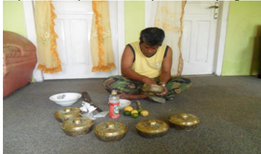
Picture 2. Process of manyadahi talempong

In the second case, only a cross-shaped mark is applied to the inside of the instrument, without applying sadah to the inside of the momong . This is an indication that the momong is still producing a good sound but its physical vibrations need to be muted, by applying a cross-shaped mark, to ensure a balanced sound and shorten the duration of the sinpongang . The process and pattern for manyadahi talempong can be seen in the picture below.