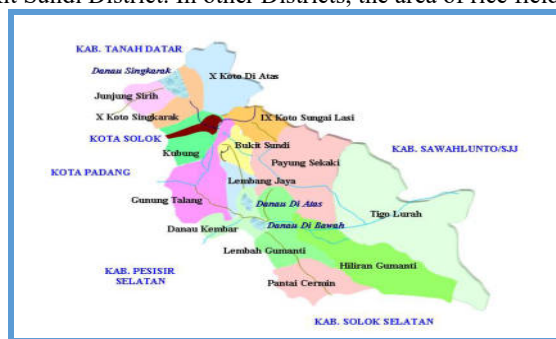
Picture 1 Map of Solok District Administration

Solok Regency as one of the administrative regions in the province of West Sumatra is trying to capture this opportunity by exploring all the tourism potential in the region. Supported by very beautiful natural potential and abundant natural resources, Solok Regency is trying to change its face to become a Regency tourism destination. Geographically, the location of Solok Regency is between 00^{\circ} 32' 14'' and 01^{\circ} 46' 45'' South Latitude and 100^{\circ} 25' 00'' and 101^{\circ} 41' 41'' East Longitude. The topography of this region varies greatly between plains, valleys, and hills, with a height of 329 meters - 1,458 meters above sea level. Solok Regency has several lakes that are famous for their natural beauty. Among the lakes, the largest is Lake Singkarak, followed by Twin Lakes (Lake Diateh and Lake Dibawah), and Lake Talang. In addition, Solok Regency also has one volcano, namely Mount Talang. The position of Solok Regency is very strategic because it is crossed by Jalan Lintas Sumatra and directly borders with Padang City as the capital of West Sumatra Province. As the center of rice production in West Sumatra, in 2010 the largest rice field area in Solok Regency was in Gunung Talang district, then followed by Kubung District and Bukit Sundi District. In other Districts, the area of rice fields is still under 3000 hectares.