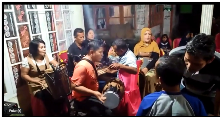
Figure 11. Katumbak music group (Document: Martarosa ransomed from the old Minang music video https://www.youtube.com/watch?v=JKVqE2Ky0q4 , accessed on September 8, 2019

the procession of the procession the bride and groom still use the musical instrument formation as before. Performances and musical instruments used by the musical group "Katumbak Bujan" can be seen in the following picture.