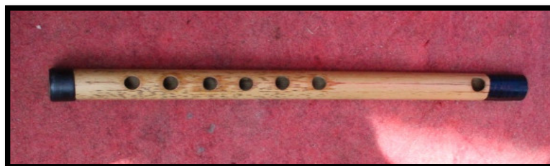
Figure 9. Flute music instrument (Photo: Imran Abdoel Gani 19 January 2019)..

The flute is a wind instrument made of bamboo. The organological shape is thirty cm long with six holes with a barrel (do-mi-fa-la-si-do). The flute in the Gambus Al-Hidayah Orchestra plays a role as the main melody carrier and filler in accompanying gambus music.