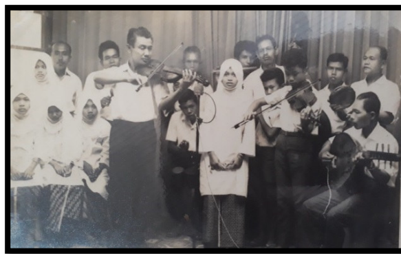
Figure 2. Gambus Al-Falah Orchestra performance in Padangpanjang in the context of The Farewell of Diniyyah Putri students in 1965.