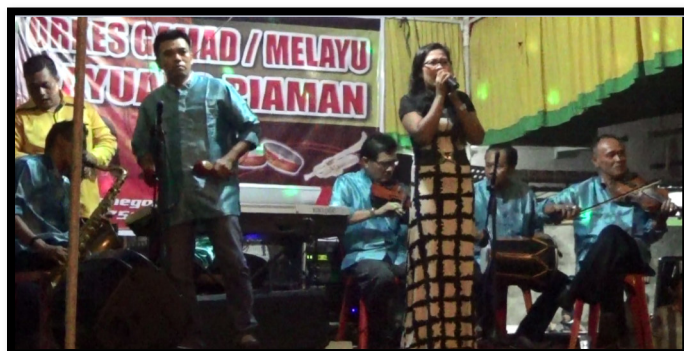
Figure 10. Gamat / Malay Dayuang Piaman Orchestra Group (Documentation: Martarosa, Kota Pariaman, 29 September 2015)

"Gamat Melayu Dayuang Piaman", the players were imported from the cities of Padang and Padangpanjang. Many of the gamat musical performances were only carried out in the context of batabuik (playing tabot) and New Year celebrations. However, at this time gamat music performances in a wedding party in Pariaman it is rarely found as is often found in the cities of Padang and Pesisirselatan.