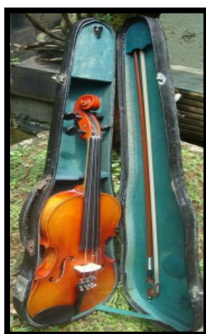
Figure 6. Violin instrument (Photo: Imran Abdoel Gani January 19, 2019 Sungai Limau Pariaman)

The violin is a musical instrument used during the Gambus Al-Hidayah Orchestra performance, this instrument is the same as a conventional conventional violin instrument, the function of this instrument as a filler and melody in performing desert songs.