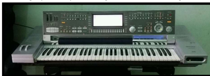
Figure 7. Keyboard instruments (Photo: Imran Abdoel Gani 19 January 2019).

The keyboard is a manufacturer's musical instrument that has a variety of tempo, rhythm and genre of music contained in one keyboard application. The keyboard in the Gambus Al-Hidayah Orchestra acts as a filler of harmony and sound of musical instruments. The keyboard plays the role of a void in gambus music. Keyboard musical instruments can accompany a variety of music genres, one of which is gambus music.