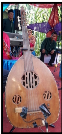
Figure 8. U'd musical instrument (19 January 2019).

U'd consists of 10 strings. According to Desri's statement, U'd instrument is a characteristic of the Gambus Al-Hidayah Orchestra music, because the sound produced by U'd makes the nuances of desert rhythmic music sound very thick. U'd function in the Gambus Al-Hidayah Orchestra performance as a melody carrier and filler.