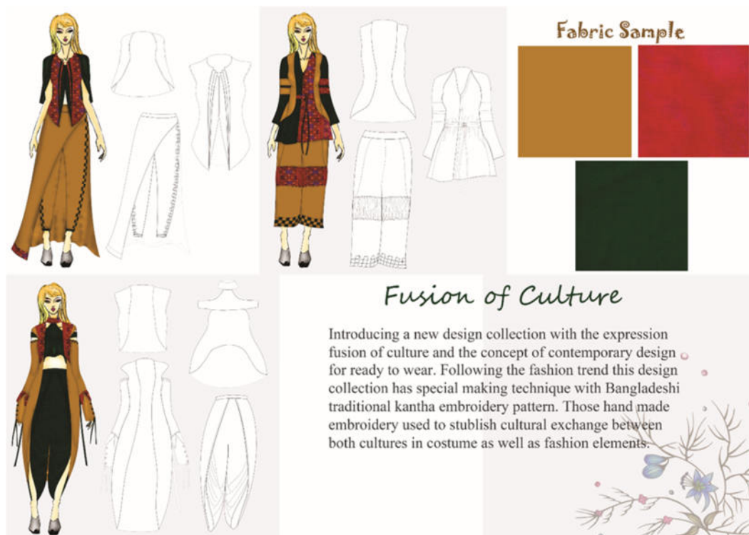
Figure 2. Final design for collection with detailing, color and fabric concept as well as inspiration explanation.