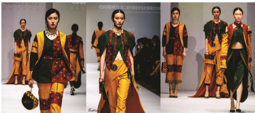
Figure 6. Picture captured during the fashion show of designer's collection in Shanghai.

Design competition and fashion show gives the opportunity to realize designer's works and it is the indicator of skill and repetition in design as well as value of concept. Pictures are taken from different angles and focuses on detailing of the costumes as a part of design competition requirements. After that designer prepared the collection for fashion show during the competition (Figure 6) and make the proper styling and makeups for the models.