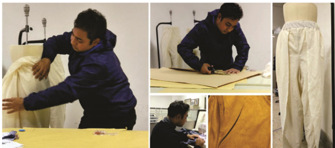
Figure 3. Images captured during step by step designer's (own) design developed process in studio.

Fashion is an appearance of sculpture. Amazingly, it works with a medium weight (fabric) that is basically two-dimensional, to create three-dimensional silhouettes and shapes, whether on the garment's surface, in the shaping of its components, and/or in its overall appearance (Lurie, 1981). In the atelier, fabric is either cut flat by instinct, with flat patterns, or draped on a dress form or model to create the patterns for reproduction and there is no complete way or many approaches. Individual pattern pieces that come out of the creation process are a set of two-dimensional shapes that, joined together, build the three-dimensional one. The basic fitted pattern shapes are called slopers: a basic sleeve, bodice, shift dress, princess-line dress, jacket, pant, and skirt pattern. From these basic fitted pieces, using a traditional dressmaker's approach, new pattern shapes can be created, controlling the actual shaping of each seam or panel, and thus, the shape of the finished garment. Pattern shapes can be combined to create new shapes.