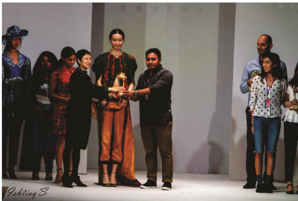
Figure 7. Image captured during award giving ceremony of "CUORI CUP- The 2nd International Student Fashion Design Competition" and author (in the middle with model) taking gold award as first price for this collection.

On April 26th, during 24th Shanghai Fashion week, the International student education management branch of Chinese higher education institute and 2018 fashion Shanghai Donghua University jointly organized "CUORI CUP" the second annual International student fashion design contest. Through the different stages of judgment before the final race, this design work "Fusion of Culture" became the first and won the "gold award prize" among the top 35 designers' work of 18 universities from 22 countries. This competition pays attention to the interaction and mutual learning of different cultures, and sets the stage for international students to display fashion design ideas. The theme of the competition is wide and creative, and it shows the fusion of "One Belt and One Road" aesthetic and multi-design culture.