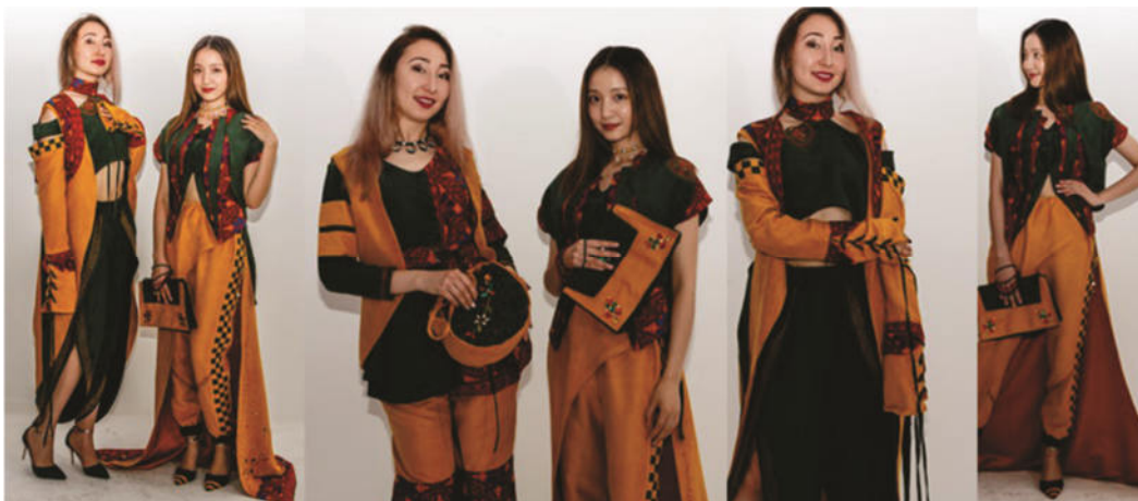
Figure 5. Images of dress fitness checking and photoshoot.

Imagination of a real looks from pictorial view is different from the final look on models' body or wearer body (Davis, 1996). Tuning in to silhouette in favor of details for a moment gives the designer, illustrator, or wearer precise control over the aesthetics of shape. After completing all the decorations in garments to give final look designer prepare the collection for checking the fittings and photoshoot to have a real experience about designs (Figure 5).