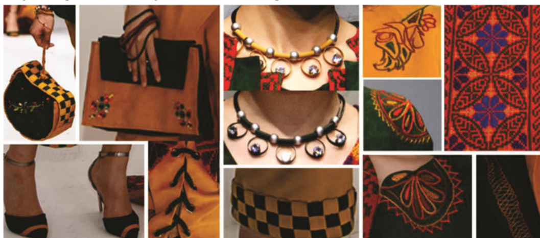
Figure 4. Images of collection's accessories, shoes, bags, ornaments, embroidery details.

A garment is cut, fit, and finished. Embellishment denotes a last step, a finishing touch, an extra, yet not without prior consideration. Since the beginning of history, decoration comes after the essential step of creating the base garment except where decorative adornments, and not garments, were the only form of body decoration. In fashion, a base garment may exist only for the purpose of carrying the ornament, or inversely an ornament is applied to a finished garment, calling attention to itself as it lures the eye, then settling into the overall look (Sproles & Burns, 1994). Embellishment is the punctuation mark of fashion design like the icing on the cake. Many embellishments walk a line between jewelry and garment. Jewelry can add interest or break up the symmetry of a garment and can be used interchangeably, depending on the mood or occasion, or even combine with different looks for different effects. Embellishments, however, carry a much higher level of commitment, staying with the garment, becoming an intrinsic part of the design, and so deserve careful consideration. The creativity in embellishment becomes the designer's choice and the wearer's agreement to carry. Prints, patterns, and textures are the more minute carriers of shapes, but when used this way, shape remains two-dimensional. On the other hand, embroidery, beads work, weaving techniques are remaining three-dimensional shapes.