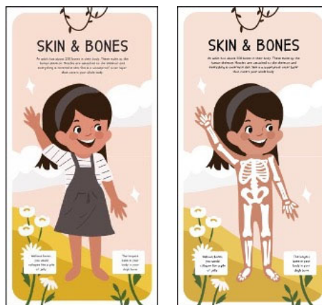
Figure 5. Skin and Bones Pages, (Sergio, 2020)

makes the atmosphere more dramatic, lighter, and creates a pleasant atmosphere. So that children are not afraid to see the shape of the skull. The most interesting in this page is the vertical layout format, while others are horizontal. To play around in this page, we need to rotate the book (Figure 5).