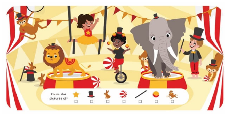
Figure 12. Activity Find the Images Pages (Sergio, 2020)

The second additional activity page is “find the words”. The atmosphere created is the joy of children on the bus to school. With the interactive lift the flab technique, the reader can open the bus windows so that the three characters are joking. The very front child character holds a flashlight with its light penetrating the word search game box. Flashlights are used as lighting to look for or see something. The reader's sense of sight is tested to look for words. Using yellow for the bus and some part of the store's awning, while has light and soft colors for background was a good way to get a quick attention of reader (Figure 13).