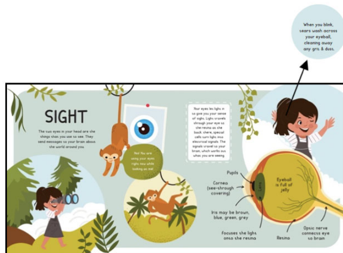
Figure 7. Sense of Sight Pages (Sergio, 2020)

The next part is the sense of hearing, namely the ears. Slightly different from the previous page, interactive activity is a button that must be pressed, and a sound is heard. The atmosphere built on this courtyard is that of life in the forest, where there are many voices that we rarely hear and realize in everyday life. Like the sound of the wind, rubbing leaves, animals, and so on. The forest atmosphere is calm, peaceful, dark because of the many large trees created from the blue, turquoise and green color families of various tones. Text is placed into groups so that it does not fill up one place only and gives a playful effect. The interactive activity on the left page uses a rotating technique to change the type of musical instrument the characters are holding (Figure 8).