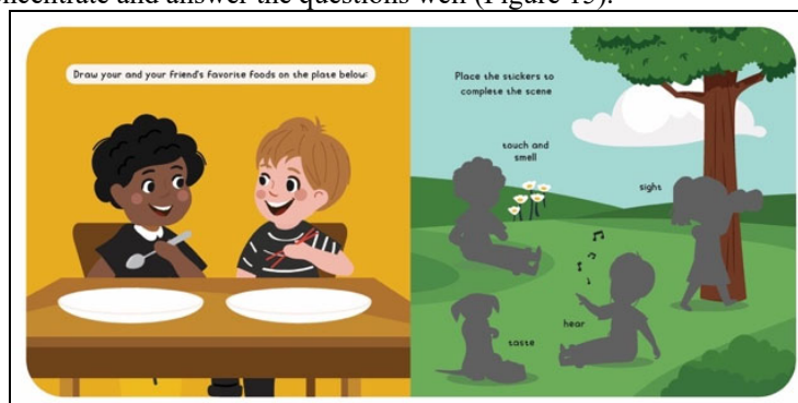
Figure 14. Activity 3 rd and 4 th Pages (Sergio, 2020)

On the next page, two activities are requested, namely describing favorite food on an empty plate, and attaching a picture or sticker according to the existing silhouette of the image. The results obtained will show the three characters doing activities related to the five senses, such as listening to music, looking through binoculars, touching and smelling flowers, and eating. Yellow reddish (orange tone) can arouse appetite (Spence, 2015). Meanwhile, on the right page, the atmosphere of the playground is dominated by green and blue, to create a beautiful, cool, and pleasant environment. This game requires careful eye in selecting and pasting objects as requested (Figure 14). The next page is the final activity in this book, which is a mini quiz, where eight questions choose the correct answer. Dominated by green and white, it creates a clean, healthy and fresh impression. A child sits on a chair and is placed in the bottom corner of the right page. Boys who are sitting can be used as an example of a learning position to do a good question is sitting, so they can concentrate and answer the questions well (Figure 15).