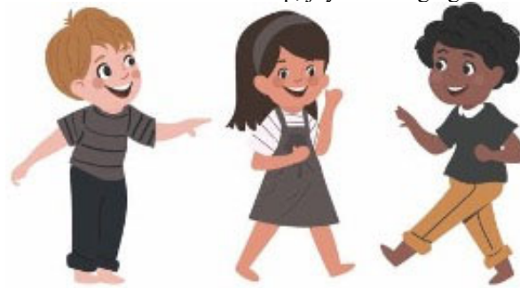
Figure 3. Character Illustration, (Sergio, 2020)

entire book contains 24 pages, excluding the front and back covers. The interactive book has 3 children (2 boys and 1 girl) as the main character with different characters and visuals. There were three racial differences: yellow hair with pale white skin, straight black hair with brown skin, and curly hair and black skin. Differences in skin color help children to understand that there are differences in races and tribes in this world. This knowledge is essential for building universal insights (Flood, 2020). The depiction of these three characters with their cute faces, round eyes, and big eyes creates a friendly and playful character, just like a typical child depiction the symbolic meaning of this difference is boundless friendship, joy is belonging to everyone (Figure 3).