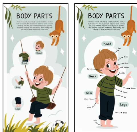
Figure 6. Body Parts Pages (Sergio, 2020)

The third spread page talks about body parts. The character of a boy with blonde hair is playing on a swing with a cloud background on this page. This section contains brief information about body parts and body structures, namely the head, body, hands and feet. The interactive activity on this page is turning over the paper in the shape of a cloud, and you will see the boy's entire body, complete with his limbs (Figure 6). A simple depiction with not too many colors (analogue colors) can make the object the main focus so that the information provided is conveyed well.