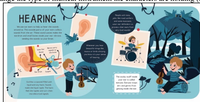
Figure 8. Sense of Hearing Pages, (Sergio, 2020)

The next part is the sense of hearing, namely the ears. Slightly different from the previous page, interactive activity is a button that must be pressed, and a sound is heard. The atmosphere built on this courtyard is that of life in the forest, where there are many voices that we rarely hear and realize in everyday life. Like the sound of the wind, rubbing leaves, animals, and so on. The forest atmosphere is calm, peaceful, dark because of the many large trees created from the blue, turquoise and green color families of various tones. Text is placed into groups so that it does not fill up one place only and gives a playful effect. The interactive activity on the left page uses a rotating technique to change the type of musical instrument the characters are holding (Figure 8).