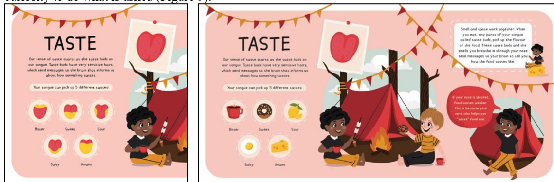
Figure 9. Sense of Taste Pages (Sergio 2020)

The next page is the tongue as a taste sense. The nuances displayed on this page are camping or camping activities, with a reddish color. Usually, when we do camp activities, we bring a variety of supplies, this is where we try different flavors. buds or the tongue and the sweet taste found in the first part of the tongue, which is the tip of the tongue. The interactive activity in this section is to draw the edge of the paper with the taste bud on the left page, so that the reader can see what types of food and drinks are being asked to taste. This activity allows readers to experience various kinds of flavors, such as bitter, sweet, sour, salty and savory. Information is conveyed in a playful way, using illustrations or visuals that are fun and playful so as to infer the reader's curiosity to do what is asked (Figure 9).