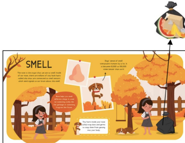
Figure 10. Sense of Smell Pages (Sergio, 2020)

afternoon by using yellowish orange and brown. These colors give a pleasant fragrance and fresh atmosphere. On this page, the reader is given an interactive activity by kissing a flower drawing that is held by this child character. It smells a nice, light and soft fragrance like we smell real flowers. Another activity is on the right page, where the character of a child is covering his nose because of an unpleasant odor, when the black plastic trash image is opened, an image of food waste is visible which causes an unpleasant smell (Figure 10).