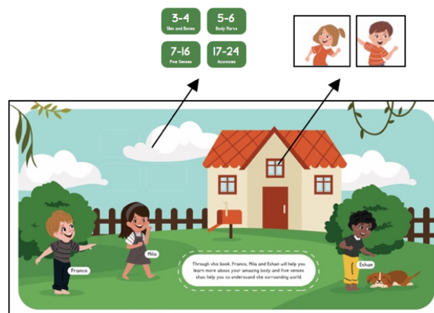
Figure 4. Table of Content Pages, (Sergio, 2020)

The front and back covers (Figures 1 and 2) have pictures of three children with happy faces; then become a character in this book; walking while holding binoculars is ready to explore a park or forest dominated by green plants and bright blue clouds as a symbol of cool and fertile nature where plants and animals live. The first spread is a table of contents page shows the kids are playing in front of the house. These three kids that always look happy are ready to invite readers to play and explore the outside environment and interesting places. The reader has been invited to play by opening the sections given a window, which is where there is information about the page numbers of each section of the book. In addition to the page number information, there is a brief description of the book. Green and light blues dominate this page, adding to a lush, lush and bright look (Figure 4).