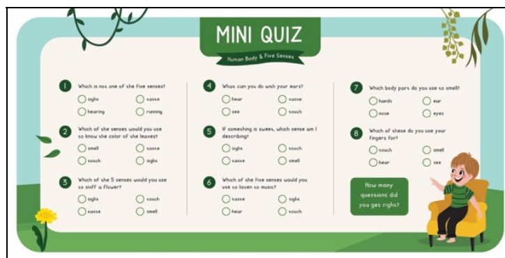
Figure 15. Mini Quiz Pages (Sergio, 2020)

The composition of design elements is arranged in such a way as to resemble a quiz question but decorated with leaves to maintain a syntactic relationship with the previous pages. Likewise, the consistent use of analogous colors (blue-green-yellow). This interactive book has been tested on grade 1 elementary school children, aged 6-7. Enthusiasm proved that books with interactive activities and attractive and fun layouts and visuals can help and improve the process of understanding difficult material.