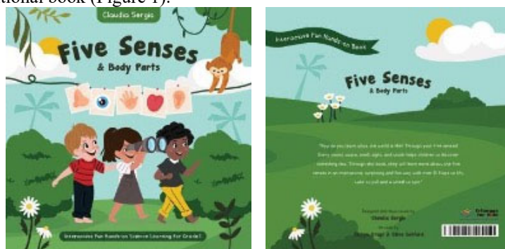
Figure 1. Front and Back Cover, (Sergio, 2020)

An interactive book entitled Five Senses and Body Parts designed by Claudia Sergio to meet the prerequisites for undergraduate graduation ( Strata 1 ) at Bina Nusantara University, on science for beginners between 6-7 years old (grade 1 elementary school), has a visual appearance, which is interesting. With a simple but attractive drawing style, attractive colors, pop-up techniques, and other sensations, this book can be used as a supplementary or additional book (Figure 1).