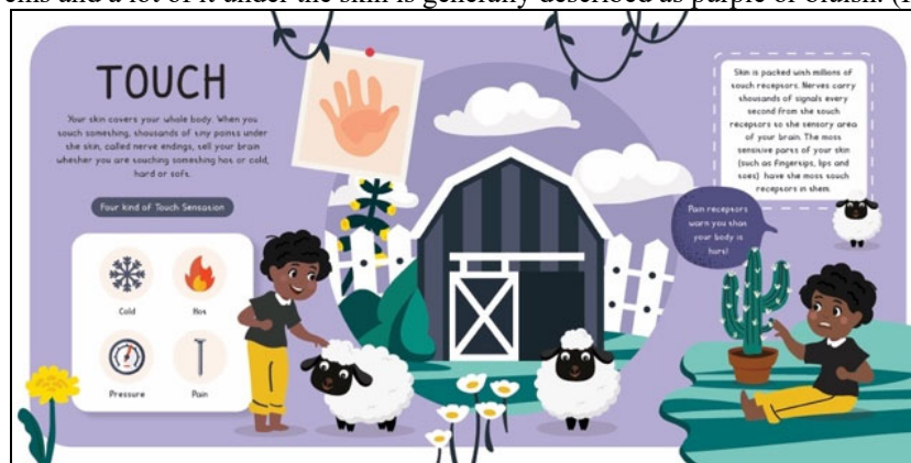
Figure 11. Sense of Touch Pages (Sergio, 2020)

The final senses discussed in this book are the touch (skin). The atmosphere you want to display is a farm, because in this unusual place there are many objects that we can touch with different sensations. For example, holding sheep's hair, thorns on a tree. Like an infographic, the text is divided according to the image. Information is given briefly and concisely. The interactive activity here is that the reader can touch the sheep and feel the soft sensation of the fleece as if we were touching a cotton ball. The color purple is used because of the sensitive color of human veins and a lot of it under the skin is generally described as purple or bluish. (Figure 11).