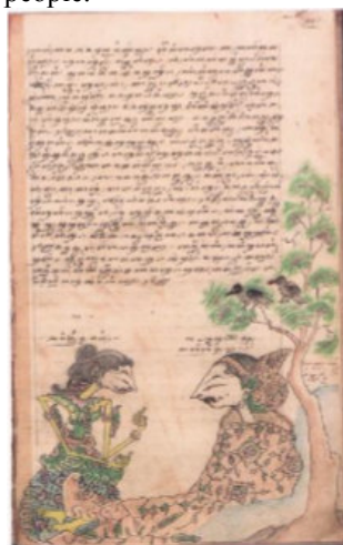
Figure 1. Illustration of Nyi Sri Pohaci (Dewi Sri) and Budug Basu in Ancient Manuscript Ksatriya Budug Basu.