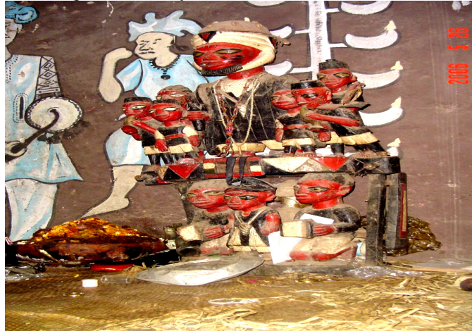
Plate 2: The Esu deity's altar in Iya Osun Osogbo's house {Photo: A.A.Adebiyi, Osogbo, 2019}

myth is supposed to become wholly part of man. This is why important symbols for most divinities on earth are 'symbolically elevated'. According to Aduke Adesola 1 , Esu is a powerful and very influential divinity. He once occupied a position that can meet the challenges of life. According to Drewal and Pemberton (1989), Esu is also the guardian of the ritual way. He bestows riches upon those who follow sacrifice as a way of life; and steals from those who do not acknowledge his authority.