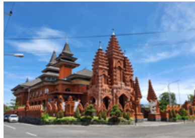
Figure 1. The Holy Spirit Cathedral Denpasar Building in Bali