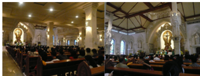
Figure 4. The Atmosphere of Worship Activities of the Holy Spirit Cathedral Denpasar