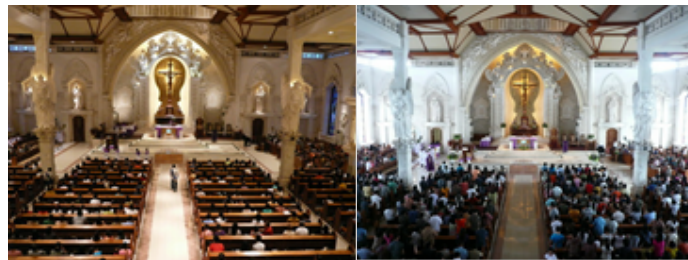
Figure 3. The Lighting of Worship Hall of the Holy Spirit Cathedral Denpasar

The building of the Holy Spirit Catholic Church in Denpasar Cathedral has a building orientation facing East-West by the provisions of Catholic religious teachings which follow the direction of the rising sun. The East direction has a symbolic meaning, namely the Sun of Christ (Sol Christi) as a symbol of Christ the Spiritual Sun for Christians. Likewise, in Balinese culture which is based on the teachings of Hinduism, the East direction as the direction of the rising of the sun is a sacred zone because the sun is considered as a source of life for inexhaustible humans. This has a significant influence on the existence of light and the formation of a religious atmosphere in the worship space of the Denpasar Holy Spirit Cathedral Church. Light in the worship space has a significant contribution to creating the overall experience of space in communicating religious meaning through the Catholic Church Concept and cultural meaning through the Balinese Cultural Concept to each individual involved in it.