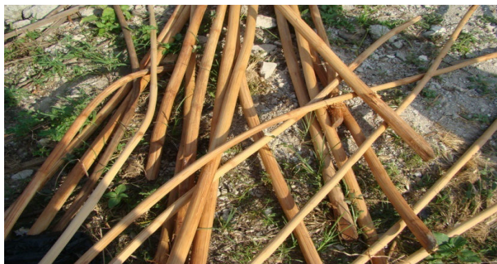
Figure 2. Rattan before sulfur fumigation

The fumigation of the two different rattan species was done in the fumigation tube, comprising conflagration pot, Fumigation chamber and the solubilization unit. For the number of times the fumigation tube has been fired, the time taken for the rattans to be brought to treatment point was 24 hours. The conflagration pot was able to house the flame produced by gas burner and very little heat was lost. It was also observed that the tube directing exhaust fumes from the fumigation chamber to condense into the solubilization unit worked as expected and there were no leakages. In this fumigation process it became obvious, that when the rattan stand erect in the chamber, the rattan are well fumigated because they stand parallel to the direction of the movement of fumes, and this ensures effective treatment. The ability of the facility to retain the fumes over a long period also helped in the effective penetration of the fumes. Products from this facility have resisted pest infestation and have shown no signs of fungi attack.