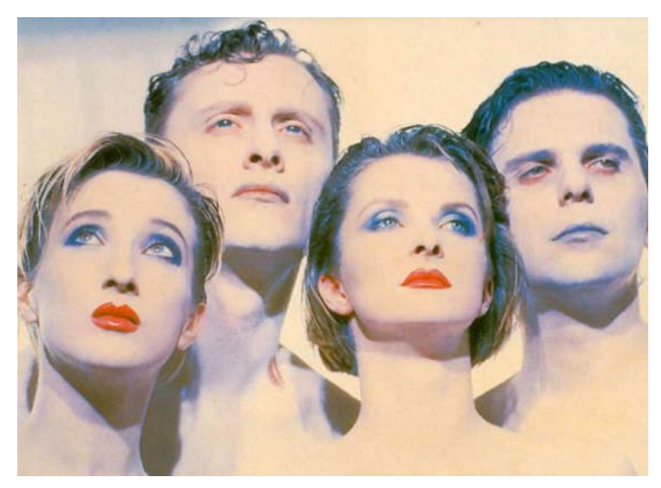
Illustration 1. Propaganda: A Deliberately Engineered Aesthetic

band's debut album A Secret Wish (1985), which presents a bold exploration of electronic music while remaining firmly rooted in the pop sensibilities of the era. The use of synthesizers allowed the band to craft futuristic soundscapes and intricate auditory textures. Tracks such as Dr. Mabuse and p.Machinery showcase the band's ability to blend robotic rhythms with melodic hooks, while also integrating cinematic references—most notably to Fritz Lang's Dr. Mabuse. In this context, the song's titular character is reimagined as a spectral presence: omnipresent, unsettling, and manipulative—a metaphor for invisible forms of power, whether political or mediadriven, in a society where individuals are reduced to mere pawns. This fusion of musical experimentation with a pop framework positioned Propaganda as a distinctive voice within a genre still negotiating the opposition between avant-garde expression and mainstream appeal. What truly sets the band apart is its capacity to craft a visual identity as sophisticated and conceptually rich as its sound. Every element—from album artwork to music videos—functions as an extension of their artistic vision. In this sense, Propaganda transcended the boundaries of music-making to construct an immersive, multi-sensory universe that redefined the aesthetic contours of German new wave.