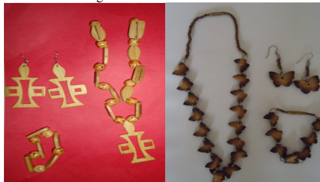
Figure 4. Bamboo Necklaces, bracelet and ear ring

Several intentions and philosophies form the foundations upon which most of these accessories were designed and made. The use and choice of material contributes to an attempt to bring the users to have an encounter with nature, a source believed to link up man with God. In this art more than a few supplementary materials in nature are employed to complement the design and production of the art and all are directed towards placing man in a