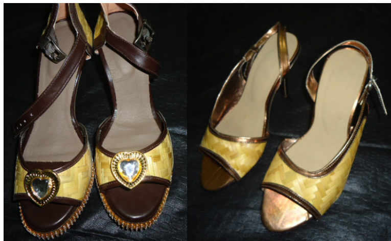
Figure 2. Bamboo lady's footwear

Figure 3, 4 and 5 are necklaces and ear rings produced out of bamboo. These were made to show the divers ways bamboo can be fashioned into jewellery. In this different forms were cut out of the culm and were given several abrasive treatments to bring it to the expected end. After that the blow torch was used to scorch parts and ends of the shape, giving effects pleasing to the eye. The butterfly was the central motive that was used for the first set. The second set was developed from a traditional form that symbolizes wisdom, the union of three heads, trinity. This was made in bamboo, integrated with metal rings and complemented 3mm glass beads. The third necklace is a composition of bamboo beads and flat pendants arranged to symbolize life. Life as expressed in this presentation is a time to be born, a journey with a mission from God as the first pendant, youthfulness, strength and hard work as the second pendant, the pick of life with achievements and successes, the fourth represents a time for reflections and amendments and finally the last pendant is representation of departure back to God. With understanding of the philosophy behind the art, wearers walk with hope and understanding of their future, and as such have meaning for life. This particular work piece was fried in oil to finish, hence the dark brown colour.