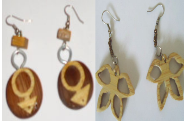
Figure 5. Bamboo ear rings

position to develop an evolution, spiritual assurance, and a means of continued existence.