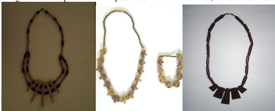
Figure 3. Bamboo Necklaces

Figure 3, 4 and 5 are necklaces and ear rings produced out of bamboo. These were made to show the divers ways bamboo can be fashioned into jewellery. In this different forms were cut out of the culm and were given several abrasive treatments to bring it to the expected end. After that the blow torch was used to scorch parts and ends of the shape, giving effects pleasing to the eye. The butterfly was the central motive that was used for the first set. The second set was developed from a traditional form that symbolizes wisdom, the union of three heads, trinity. This was made in bamboo, integrated with metal rings and complemented 3mm glass beads. The third necklace is a composition of bamboo beads and flat pendants arranged to symbolize life. Life as expressed in this presentation is a time to be born, a journey with a mission from God as the first pendant, youthfulness, strength and hard work as the second pendant, the pick of life with achievements and successes, the fourth represents a time for reflections and amendments and finally the last pendant is representation of departure back to God. With understanding of the philosophy behind the art, wearers walk with hope and understanding of their future, and as such have meaning for life. This particular work piece was fried in oil to finish, hence the dark brown colour.