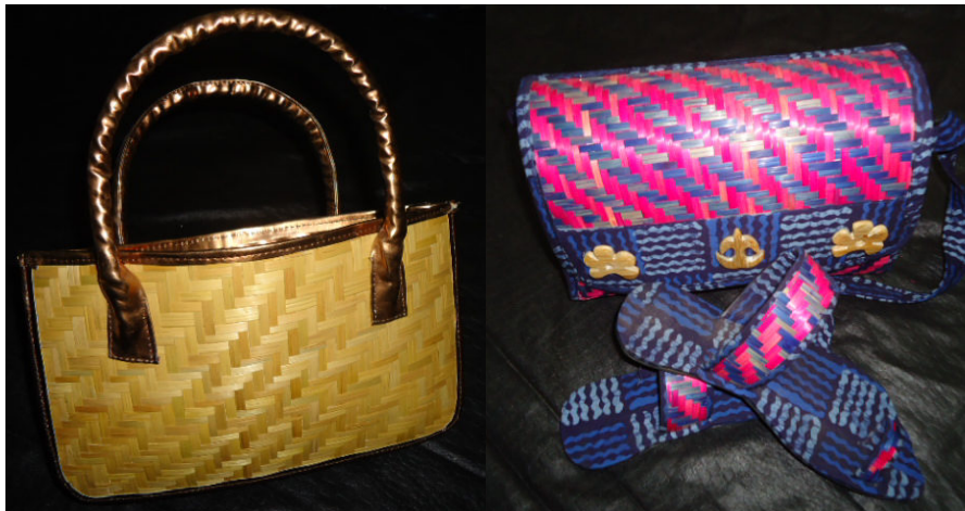
Figure 1. Plain and Dyed bamboo bag & slippers

In Ghana today, bamboo is proving to be one of the adoptable engineering material for the fabrication of crafts. Steiner et al (2013) said bambusa bambos, a sympodial bamboo in Ghana has now been adopted as one of the most important manufacturing resources for flooring. This material now provides an alternative to timber wood for flooring. It is the adoptability of bamboo which made this possible. Within the adoptable nature of bamboo, several products have evolved which are complementary or accessories or garnishing for fashion. This writing makes known some of these products as a confirmation of the dynamic and adoptable capabilities of sympodial bamboos in Ghana.