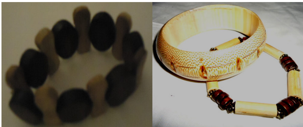
Figure 7. Bamboo hand bangles