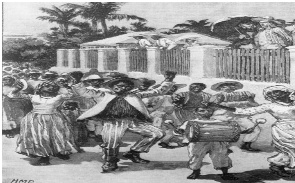
(Fig. 1-2 Traditional Carnival Celebration)