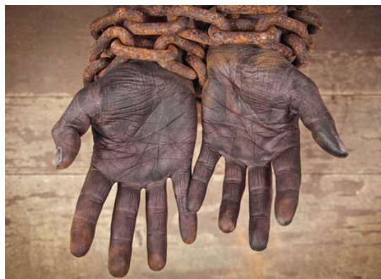
(Fig.1-1 Slavery Period)

As a result, Emancipation Day is commemorated every year in territories where slaves once resided. In Grenada, a public holiday is set-aside on the first Monday of August. This joyous day is celebrated with much importance to the citizens of Grenada because it is on this day that total independence was granted. Emancipation Day is celebrated very colorfully and in a grand manner. People throng the streets in huge numbers as spectators and performers depicting the devils and the social commentaries of previous years. They are accompanied by dance and sounds of steel bands and DJ's music of the latest songs of the year. (Fig. 1-2)