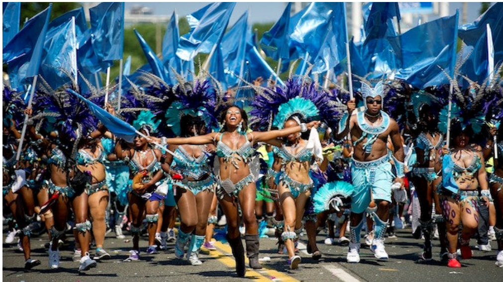
(Fig. 2-2 Carnival Street Parade)

The festival is held in August, one of the hottest months in the Caribbean. The feeling of emancipation brings together peoples of all statuses, celebrating to the intoxicating sound of music, dance and food into a pageantry