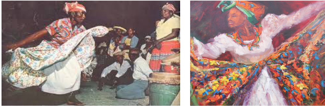
(Fig. 2-4 National Dance Festival)