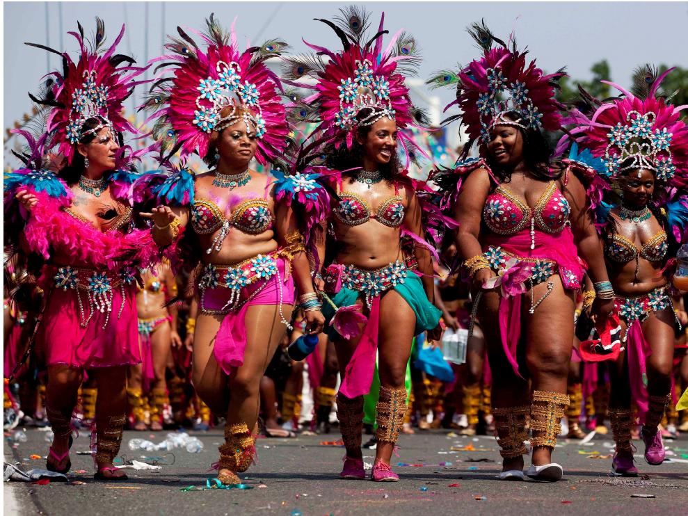
(Fig. 2-1 Masqueraders)