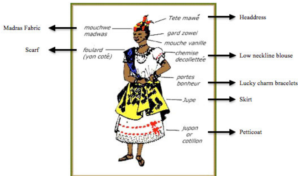
(Fig.1-3 Grenada's traditional Dress)