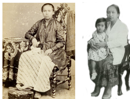
Figure 2: Picture of concubines

The segregation policy of the colonial government which was implemented in 1870-1930 on the fashion of Batavia residents (Figure 1) seemed paradoxical because the regulation only regulated how a person dressed in public spaces. Thus, a paradoxical style emerged when the fashion was worn in a domestic space. This could be seen when European people wore batik. In this process of cultural acculturation, concubine figure had a significant role because they acted as female who filled male-female inequality in European households. In this position the concubine absorbed European culture brought by European men such as fashion, dishes, etc. Concubine also acted as agent of cultural change, one of which was by introducing the use of batik as fashion.