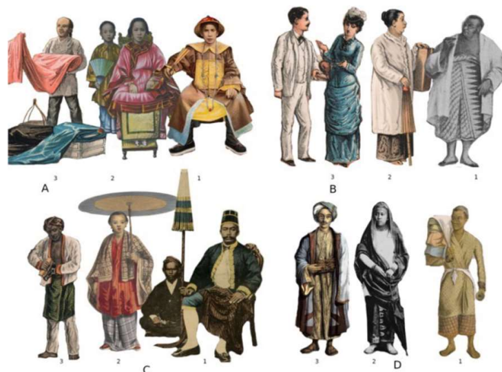
Figure 1. The diversity of fashion in Batavia 1870-1930