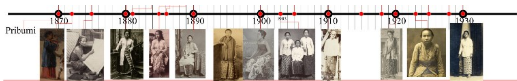
Figure 4: Indigenous women's fashion in Batavia 1870-1930