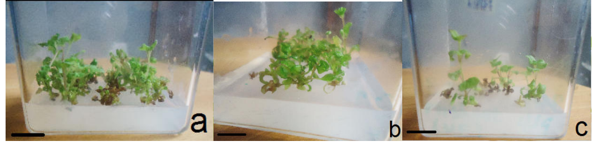
Figure 1. Shoot initiation from in vitro germinated seedling on MS medium enriched with a) 1.5 mg/l BAP, b) 0.5 mg/l BAP, c) 0.5 mg/l KIN. Bars = .1 cm

Means within columns having different letter (lower case) in superscript are significantly different at p < 0.05.