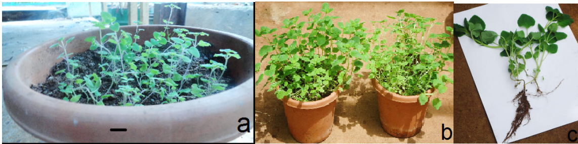
Figure 4 . Acclimatization of plantlets of S. abyssinica in greenhouse. a) After 60-days, b) After 90-days, c) uprooted 90-days old plant. Bars = 1 cm.