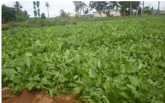
Fig.2. Palak leaf vegetation.