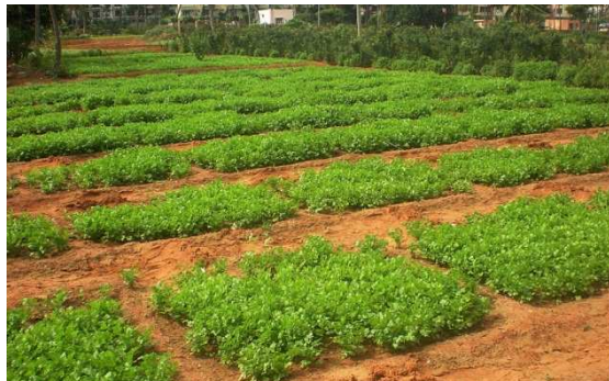
Fig.3. Coriander leaf