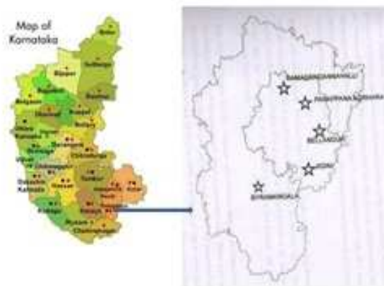
Fig.1. Study areas in Bangalore urban district of Karnataka.

Five experimental stations selected were Byramangala ( S_1 ), Bellandur ( S_2 ), Ramagondanahalli ( S_3 ), Jigani ( S_4 ) and Parappana Agrahara ( S_5 ) areas (Fig.1). Tanks of these areas receive effluent discharges from industries manufacturing batteries, textiles, steel, paints, food processing and chemical products.