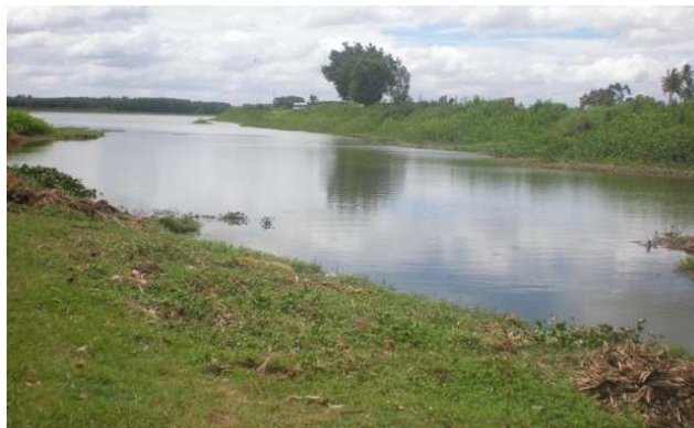
Fig.4. Storm water.

Random water samples (Fig.4) were collected separately from different tanks in pre-cleaned 100ml polythene bottles and 2ml of nitric acid was added as preservative. Water samples should be kept in insulated field kit containing ice and will be brought to laboratory. 10ml of water sample was taken in Teflon tubes and 1ml con. \text{HNO}_3 was added. Vessel is closed with valve and tightened. Then inserted into a single safety shield carousel and into microwave chamber. System was pre-programmed using Ethos D control terminal (equipped with software) for 5min. of digestion at 250W power and automatic ventilation for 2min. Then digested solution cooled and made up to 100ml with Milli-Q distilled water. Samples stored in pre-cleaned plastic bottles and used for analysis. Control samples were collected from station where normal water was used for irrigation.