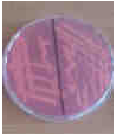
Figure 2: S. aureus Gron on Mannitol salt agar medium