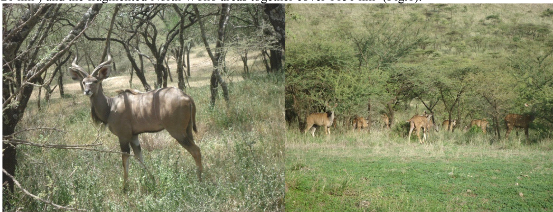
Figure 1 : Greater kudufrom Arsi Mountains National park Dera dilfekar block

In Ethiopia different ecosystems and diverse topography provide a wide spectrum of habitat type for many fauna and flora species. Ethiopia accounts 70% and 80% of all the afro-tropical lands above 2,000 masl and3,000masl of all the lands (EWCA, 2012). In the southeast part of the country Bale Mountains National Park has some of the largest areas of continuous and Afro-montane forest habitats in Africa followed by the fragmented Afro-alpine ecosystem in the north western highland (Beyer et al., 2010). Bale Mountains National Park covers about 1990 km 2 followed by Arsi mountains national park in Arsi zone of oromiya regional state in Ethiopia which covers about 1000 km 2 . The study of Beyer et al. (2010) also indicated that the coverage of others Afro-alpine areas are in northern Ethiopia; Simien Mountains National Park (960 km 2 ), South Wollo (1220 km 2 ) and the fragmented North Wollo areas together cover 1150 km 2 (Fig.1).