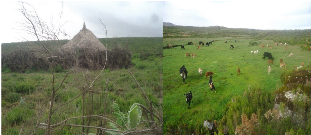
Figure 3: Illegal Settlement and Over Grazing in Arsi Mountains National Park