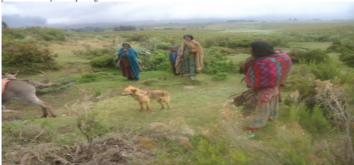
Figure 4: Dog in Wildlife Area; Chilalo- GalamaArsi zone

For improved wildlife management Wildlife disease management is the most important issue especially for threatened and endangered species (Riley et al. , 2002). Other wildlife species, domestic animals and humans may be affected by some pathogens