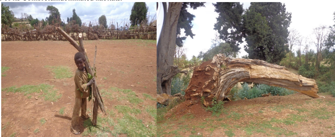
Figure2: Deforestation and Forest Degradation in Tanna district, Arsi zone

and siltation of water bodies and loss of soil productivity attributed to cause negative impacts on faunal populations (Kidegheshoet al. , 2001). According to the study conducted by Sinclair 1995 in Serengeti, Tanzania Roan antelope ( Hippotragus equines ) is reported to be locally extinct in many areas of the ecosystem due to the loss of its Combretum dominated habitats.