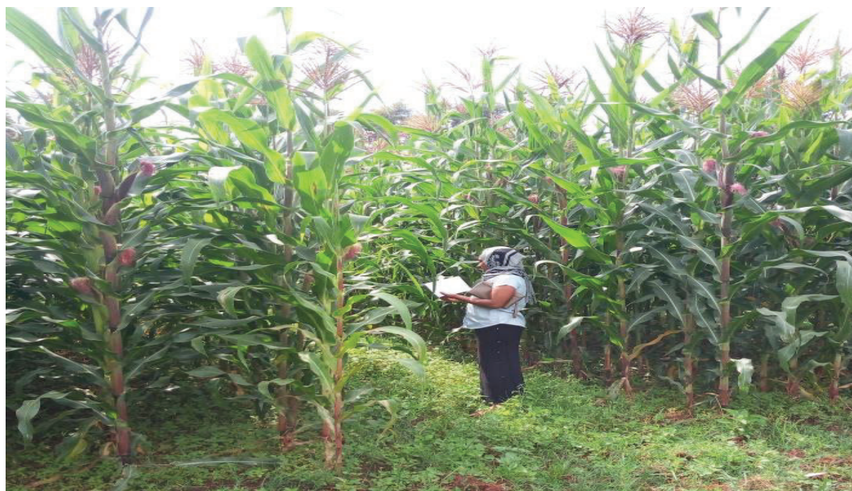
Fig2: Silking and tasseling stage of maize

DT =days to 50% tassling, DS= days to 50% silking, DM=days to 90% maturity, days to followed by the same letters in a column are not statically different at p < 0.05 .