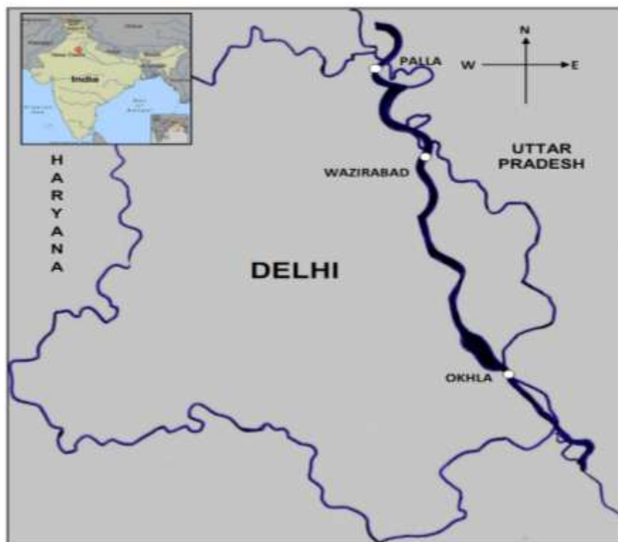
Figure 1: Map showing Yamuna River in Delhi, India