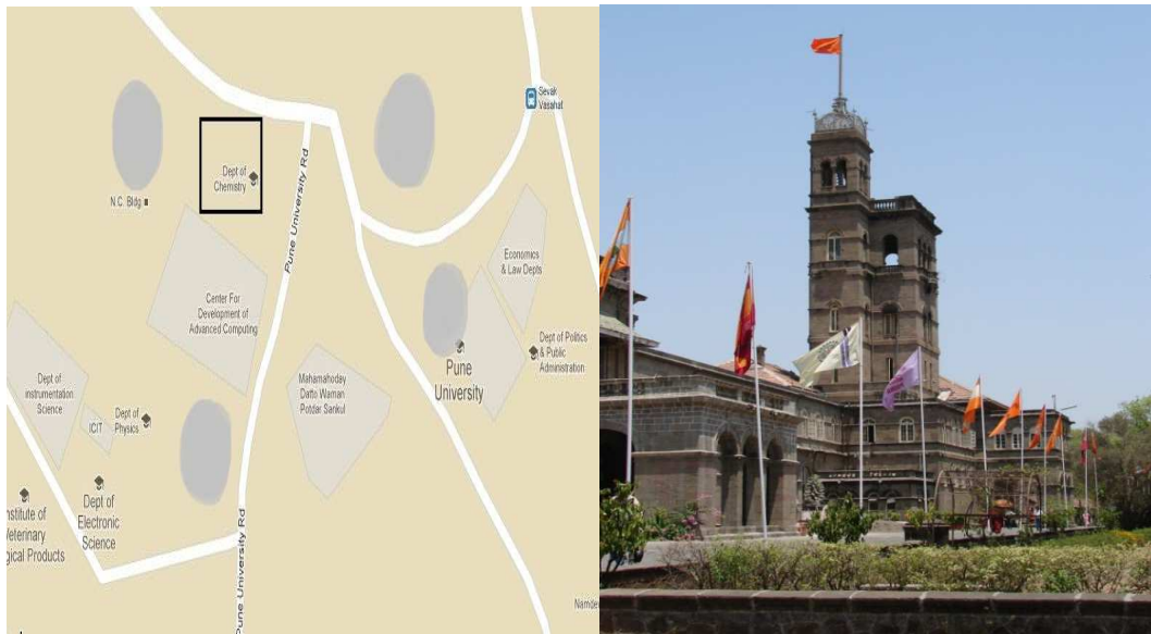
Figure 1 The map and the historic building at the specific location

On the left is a GUI representation of the augmented environment. (Department of Chemistry) The semi-transparent circles represent video stream. On the right is a photograph of the area we are augmenting, from the perspective Department of Chemistry. The stream consists of a single primary video, with other video plaited into the border. These plaits of video overlap the stream, with each plaits of video shifting into and out of recognition. The use of plaited video in addition to the primary video allows for the creation of highly individualized streams. For example, the primary video may be the reflections of an individual on the nearby architecture. The author's favorite video clip or animation could then be plaited around the edge of the reflections.