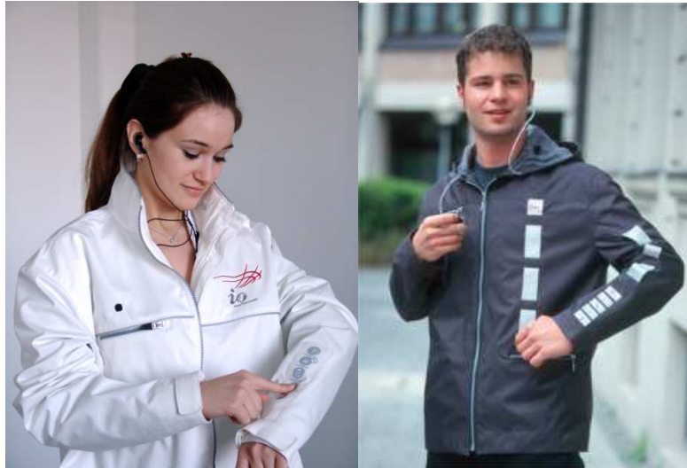
Figure 2 The wearable devices

Many AR systems have been developed for navigating spaces. It is rare to find one that also allows the user to easily create or modify a space. With most systems, one must view or listen to material created by others. It would require programming experience and extensive knowledge of the internal structure of the AR system to create a new environment.