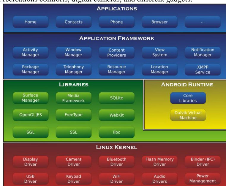
Figure 5. Android's architecture diagram.

Android is an operating system works on the Linux kernel. Every mobile or tablet comes with the Linux kernel version number. A client interface focused around immediate control, composed basically for touch screen cell phones, for example, cell phones and tablet workstations, utilizing touch inputs, that approximately relate to certifiable movements, such as swiping, tapping, squeezing, and opposite squeezing to control on-screen items, and a virtual console. In spite of being essential intended for touchscreen information, it additionally has been utilized within TVs, recreations comforts, digital cameras, and different gadgets.