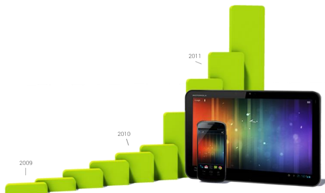
Figure 2. Android Growth in device activations.