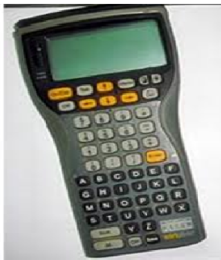
Figure 1: Data logger

Another method that was used for water meter reading was reading the water meter by using data logger. Data loggers are portable electronic machine (equipment) mainly meant for capturing data at sites. They are used for the same purpose to download data into the system after reading for the purpose of preparing customer bills. Although the introduction of data logger aimed at improving efficiency in water meter reading but still it was the same as the manual system which requires the water meter reader to deliver the device (data logger) to the office in order to download data taken from the site.