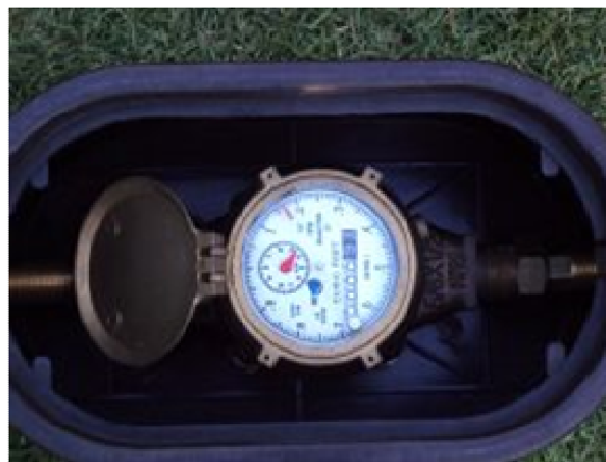
Fig 3: Water meter [11]

A water meter is a device which collects and registers information on the volume of water used over a period of time at a particular location. The subsequent information which is the volume of water used since the installation of the meter is used to calculate the amount charged by the water utility company to the customer for water usage at that location for that billing period [3].