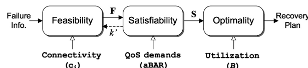
Fig. 1. Localized reconfiguration planning in ARS. ARS generates a reconfiguration plan by breaking down the planning process into three processes with different constraints.