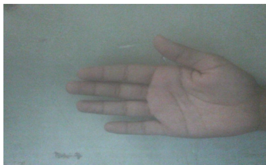
Fig 2: original hand image