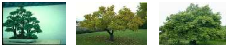
Figure 4. Retrieved images when HSV Color space is used