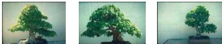
Figure 5. Retrieved images when YUV Color space and Texture features are used