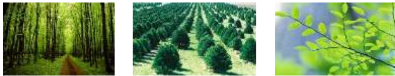
Figure 3. Retrieved images when RGB Color space is used