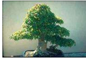
Figure 2. Sample image given to test for RGB, HSV and YUV